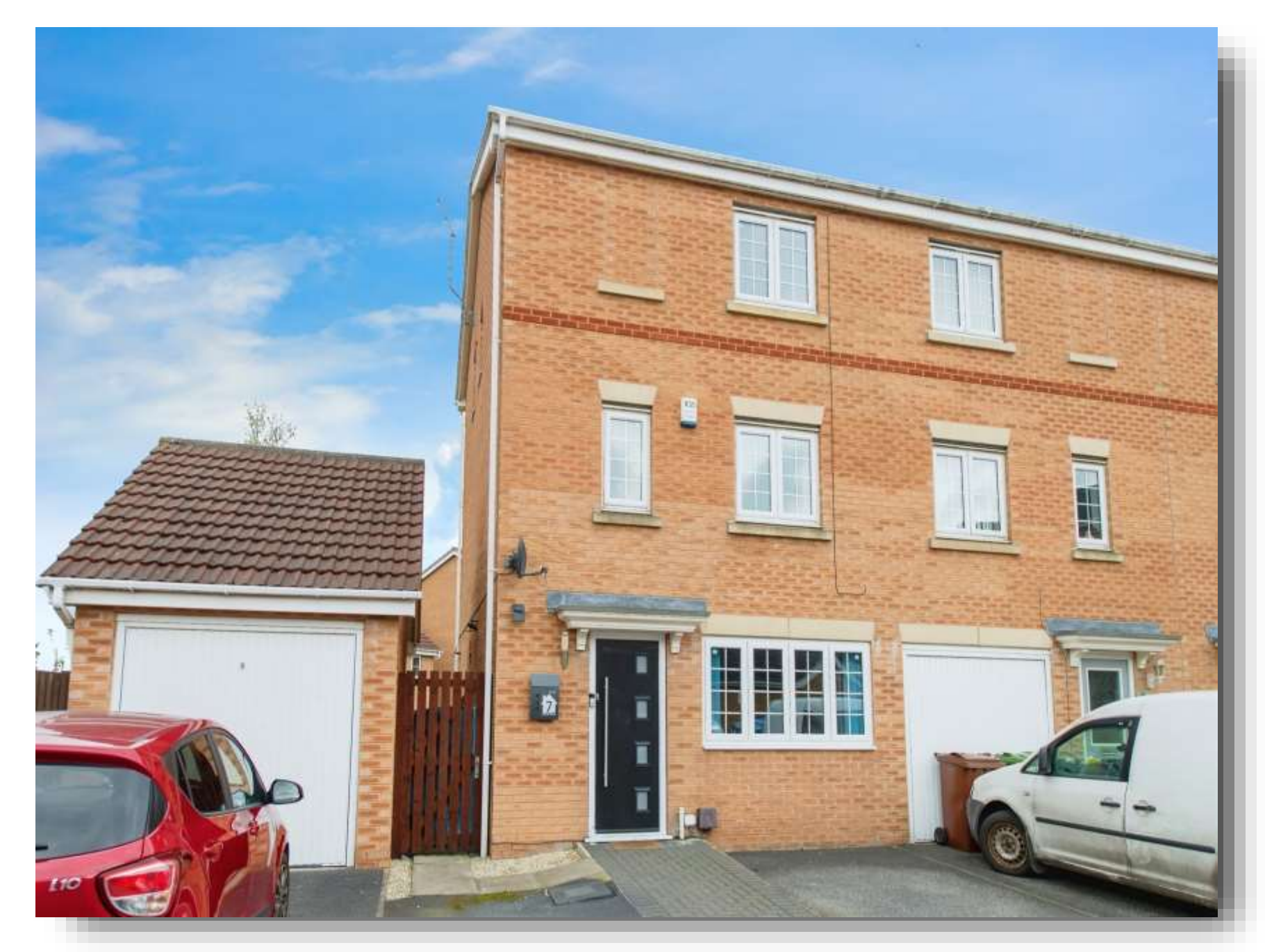
Millers Croft, Castleford WF10 5LP