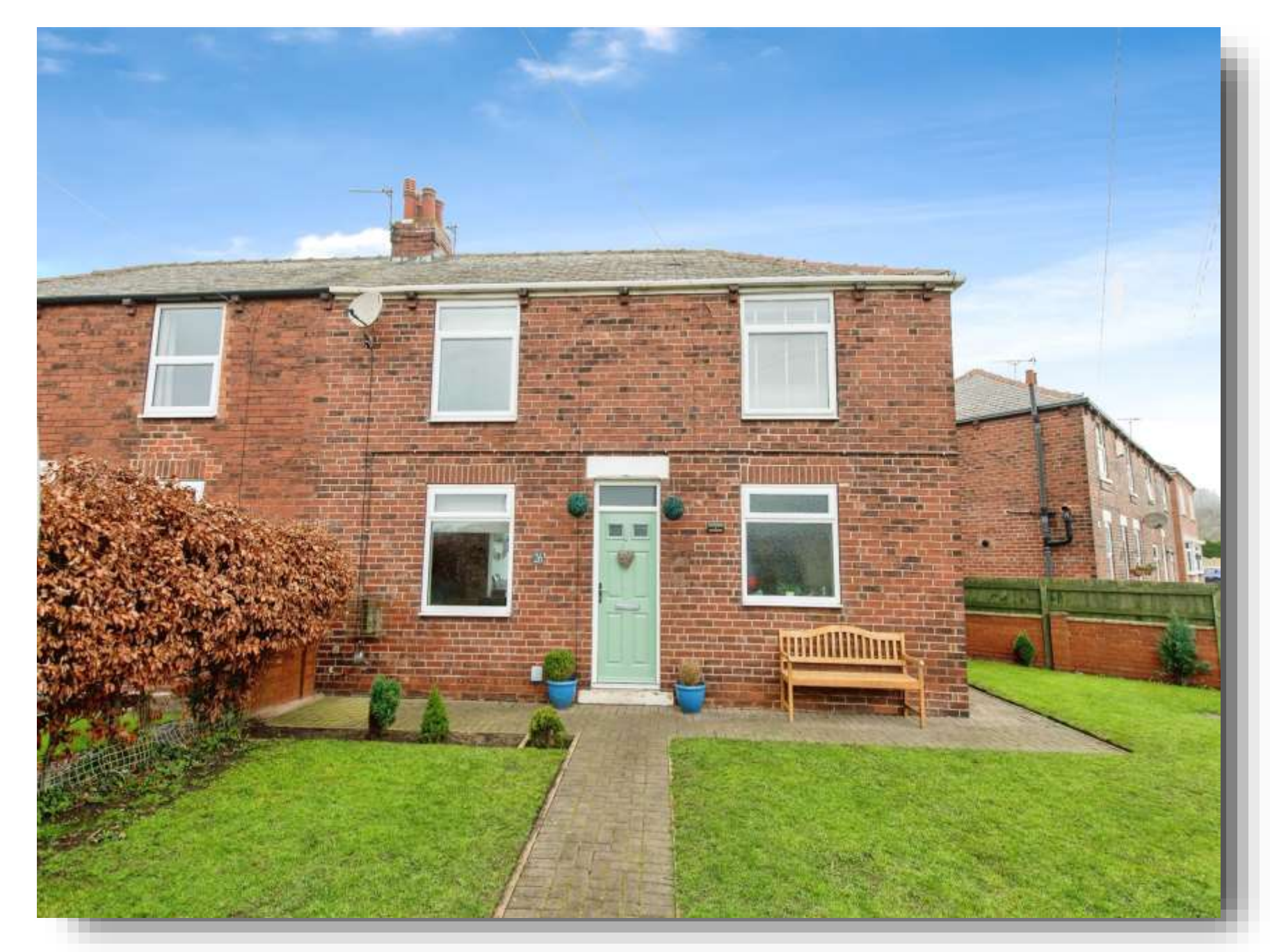
St. Margarets Road, Methley Leeds LS26 9JT