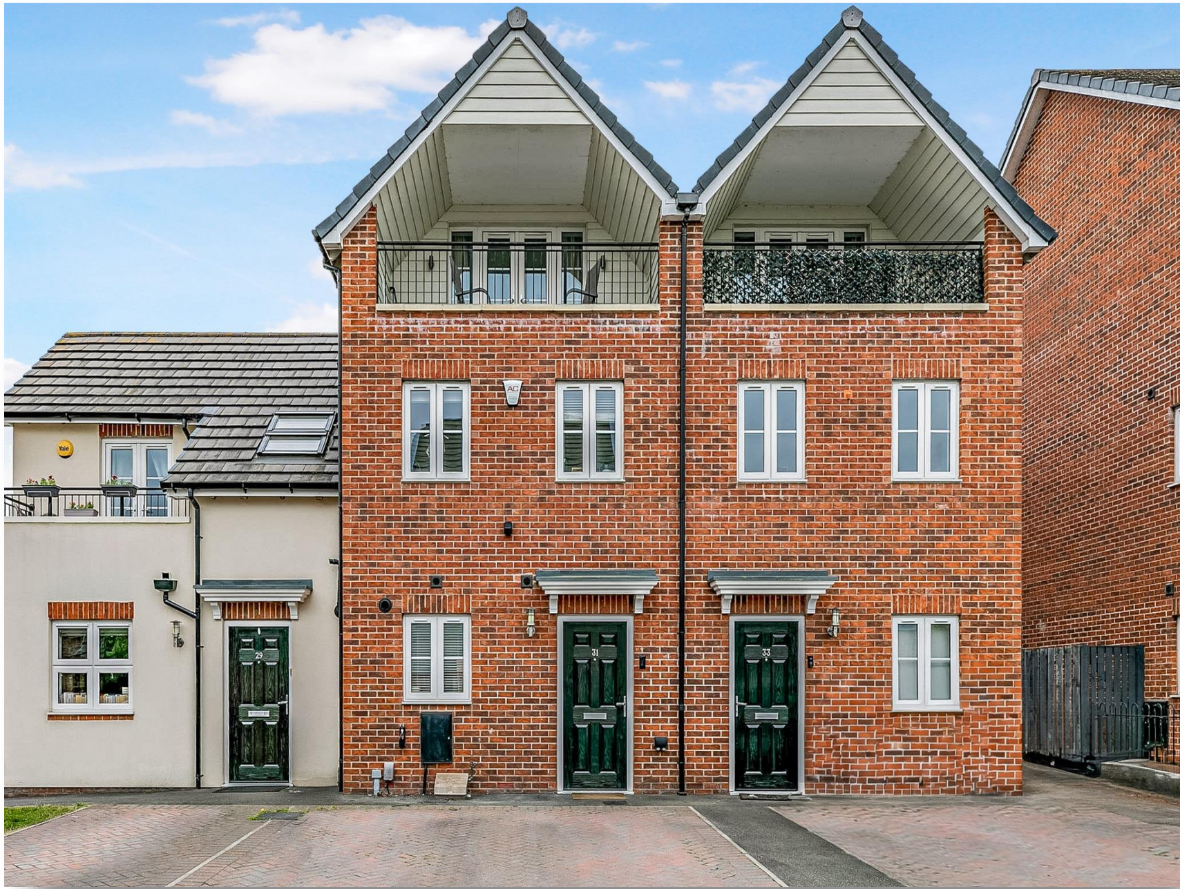
Grove Street, Castleford WF10 1AR