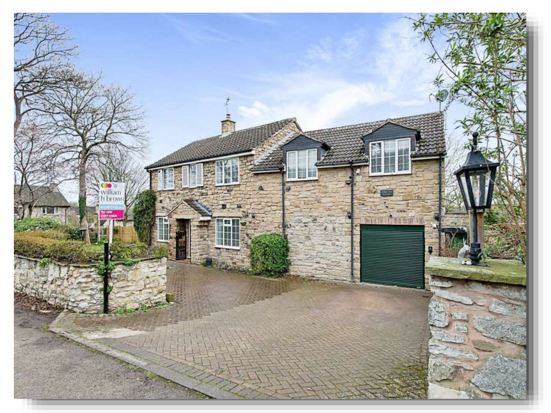
Cherry Tree Cottage Hall Lane, Ledston Castleford WF10 2AU