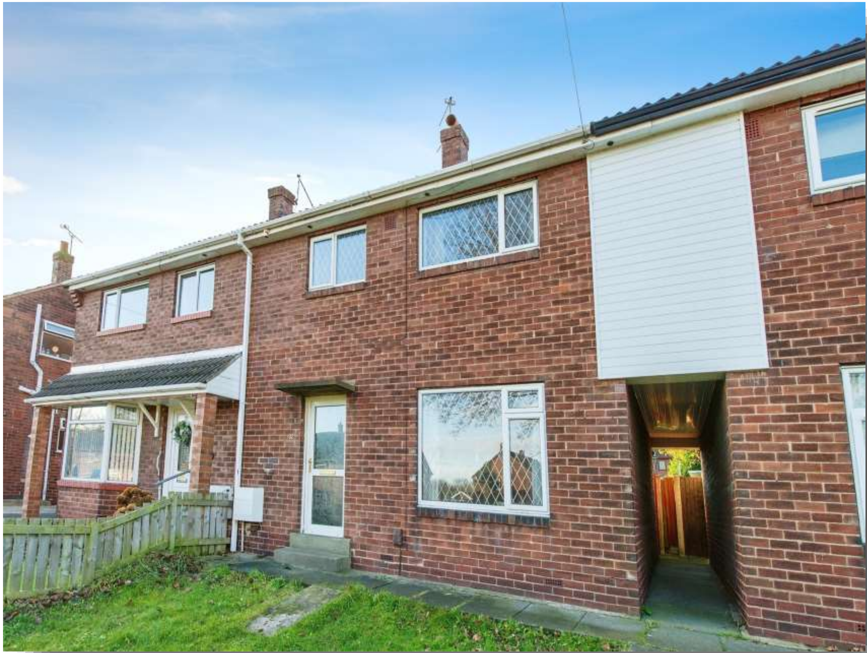
Kendal Drive, CASTLEFORD WF10 3RZ