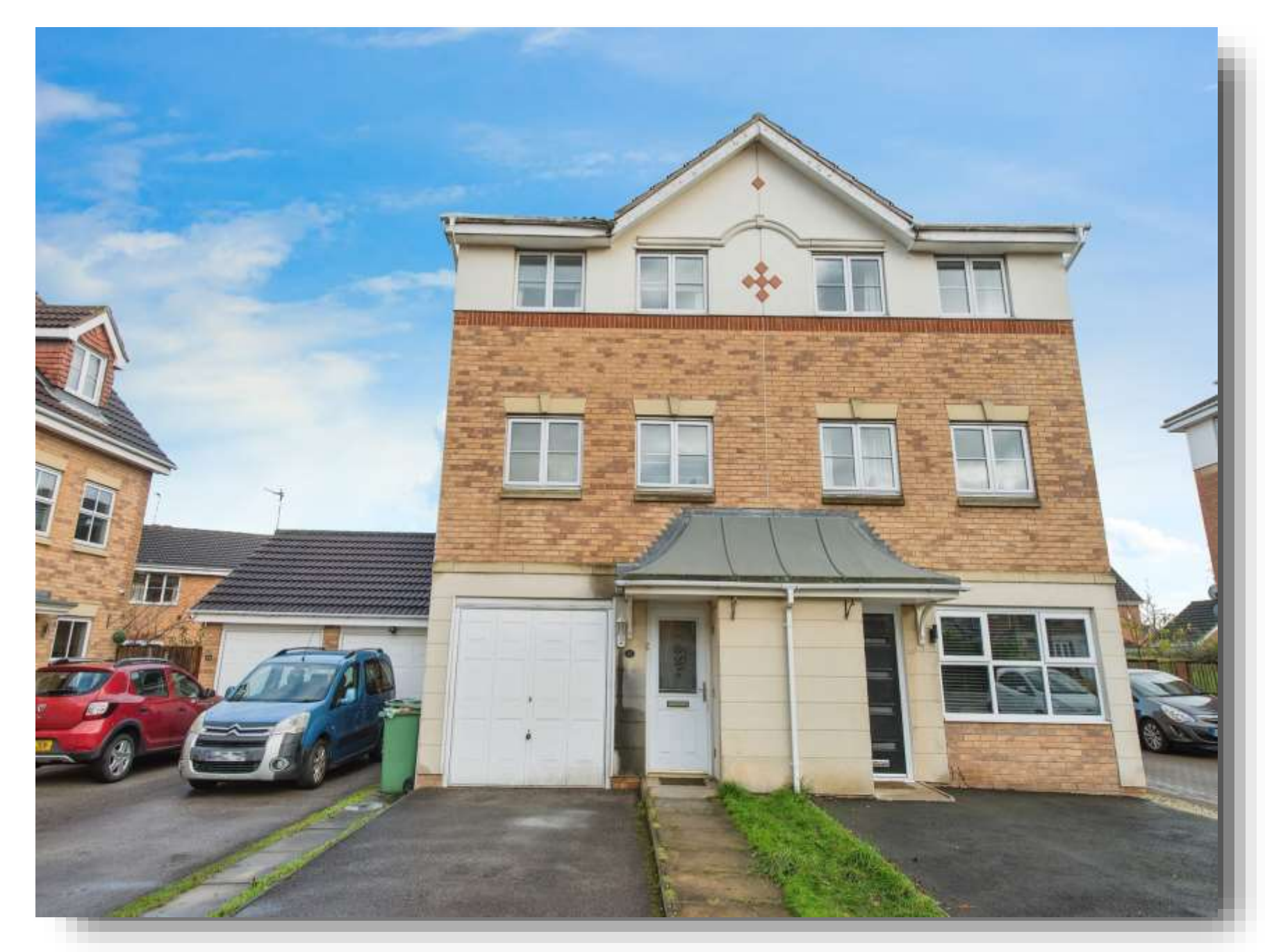
Morris Fields, NORMANTON WF6 1WT