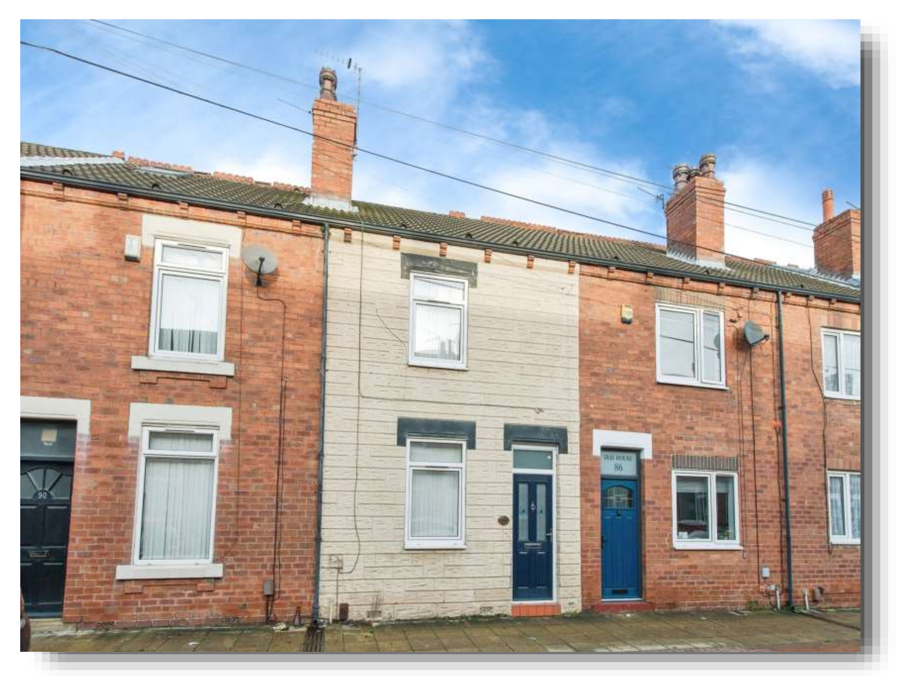
Ambler Street, Castleford WF10 4ED