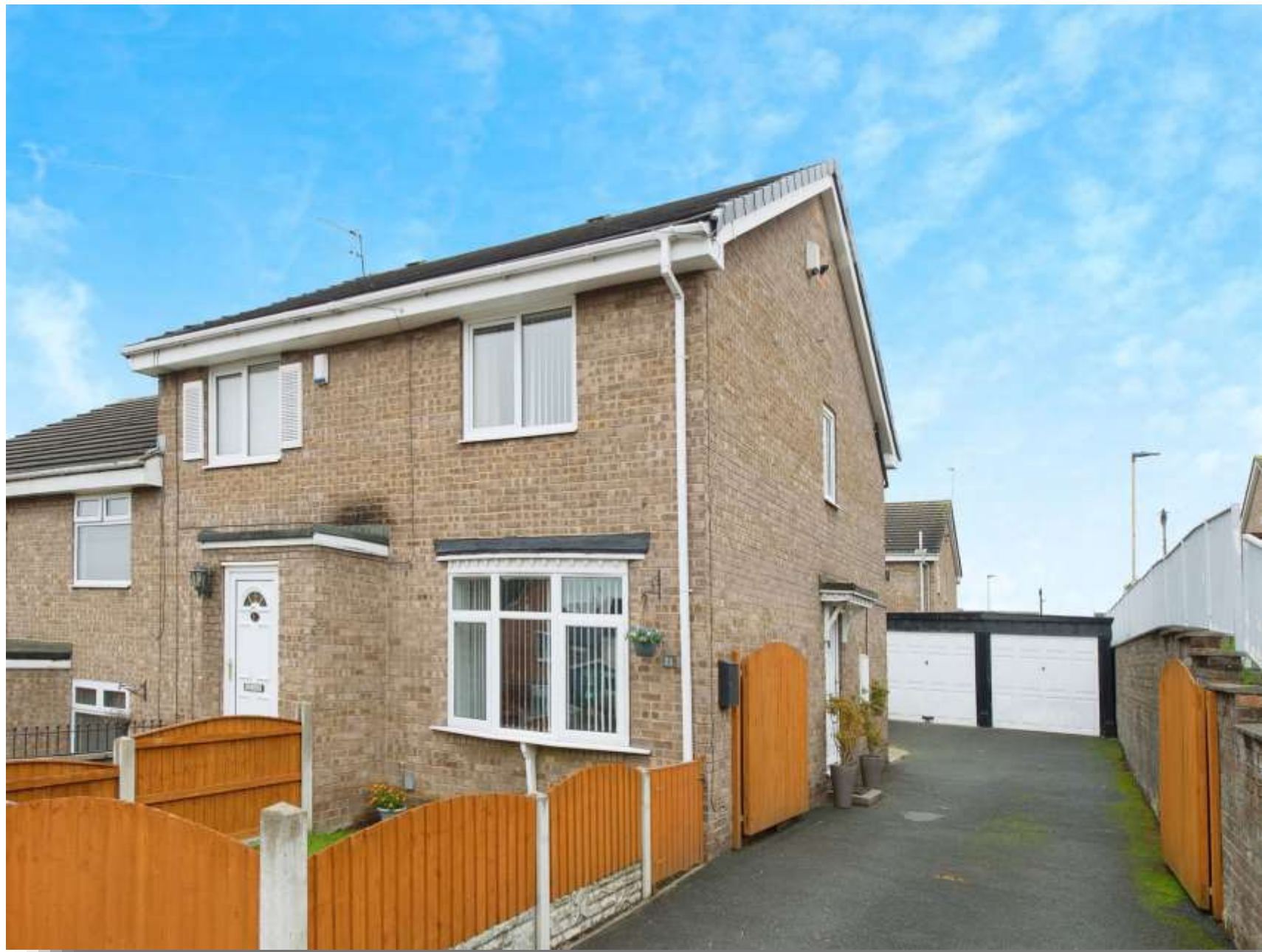
Edendale, CASTLEFORD WF10 4LT