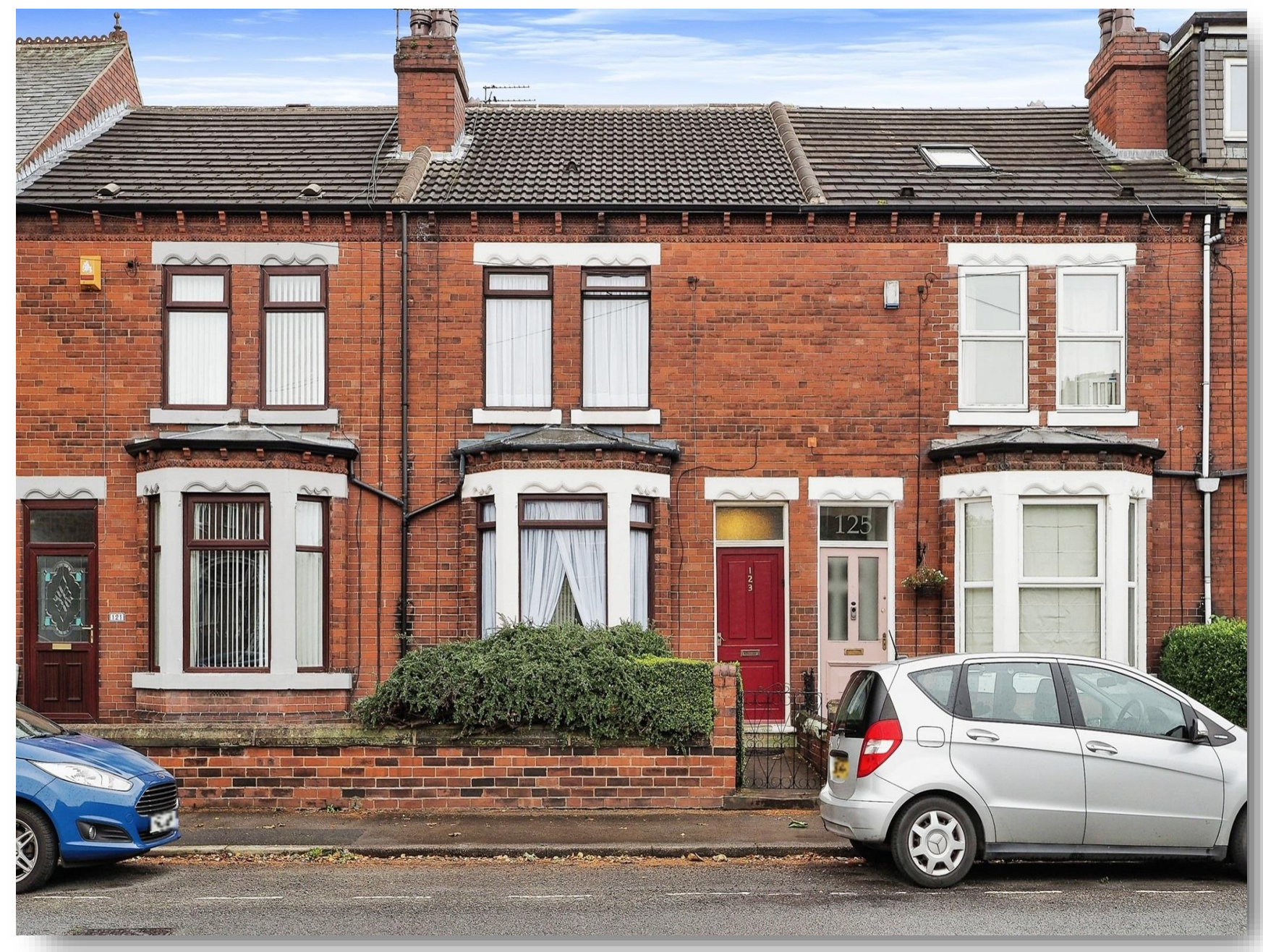
Church Lane, Normanton WF6 1AY