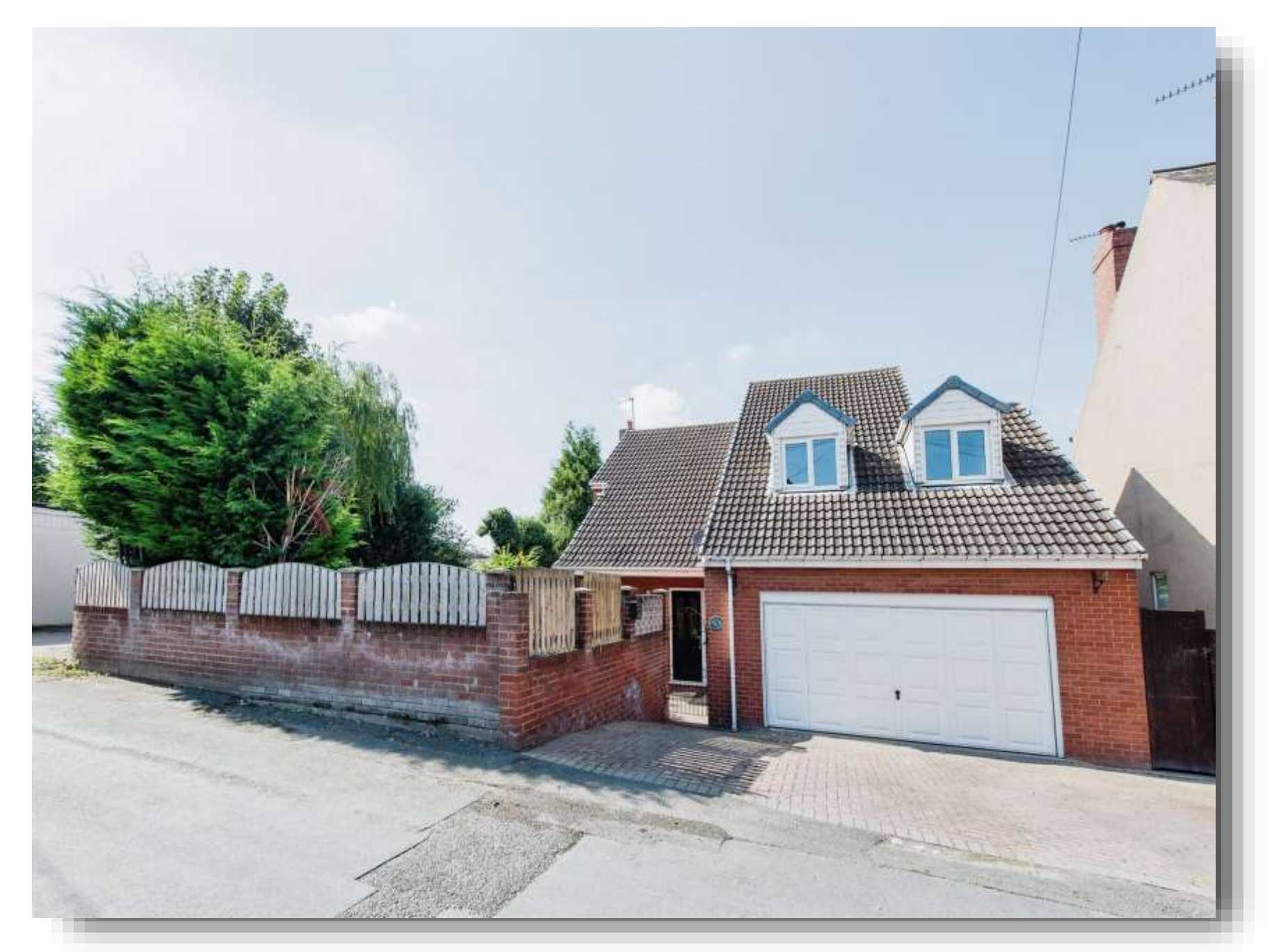
Holes Lane, Knottingley WF11 8LH