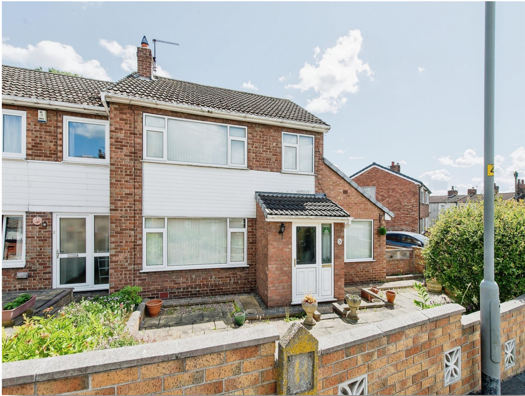
Ramsden Close, Brotherton Knottingley WF11 9LG