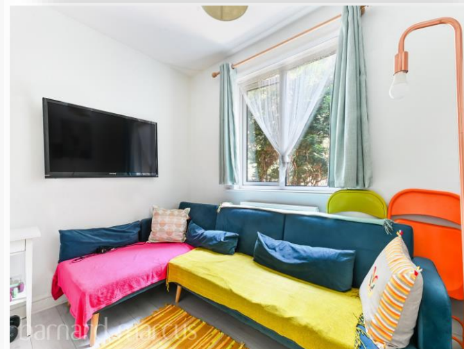
Walton House, Merton Road, London SW18 5EJ