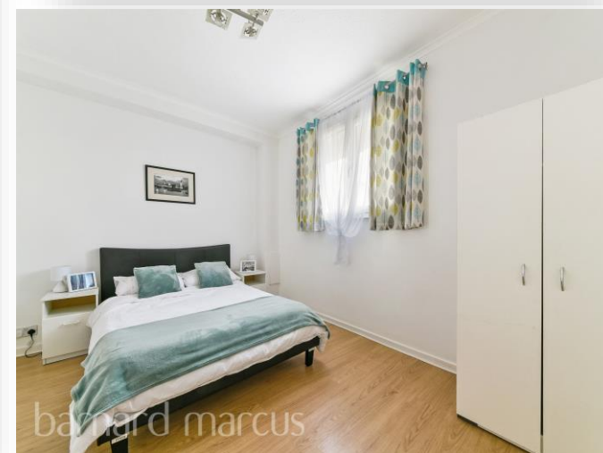
Edgecombe House, Whitlock Drive, London SW19 6SL