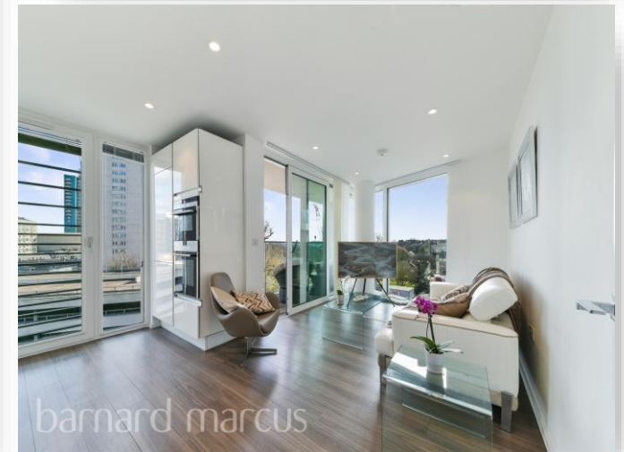
Aurora Apartments, Buckhold Road, London, SW18 4FW