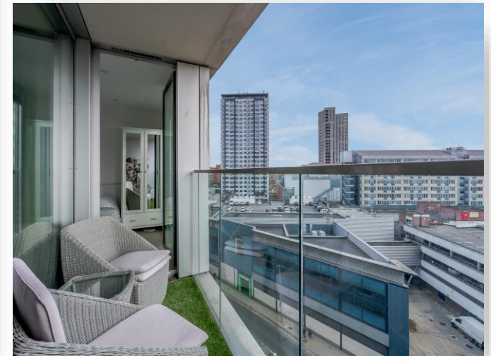
Aurora Apartments Buckhold Road, London SW18 4FW