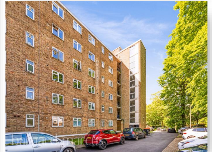
Chobham Gardens, London, SW19 6HA