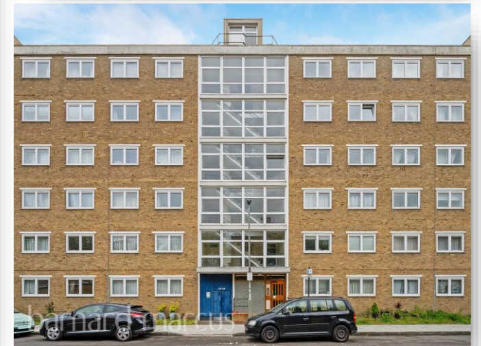
Greenfield House, Tilford Gardens, London, SW19 6DN