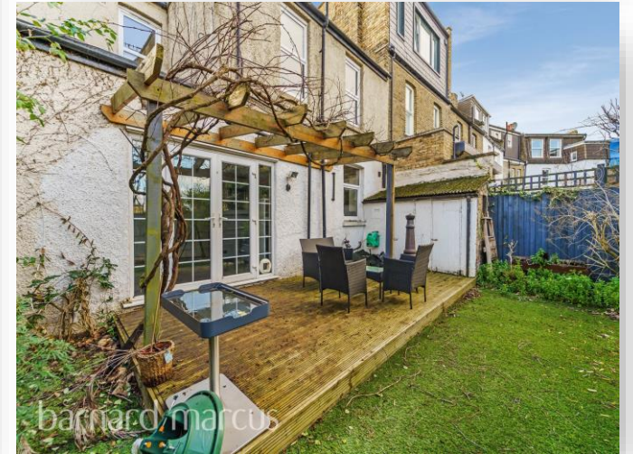
Jephtha Road, London, SW18 1QH