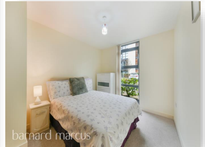
Knight House, Scott Avenue, London SW15 3PB