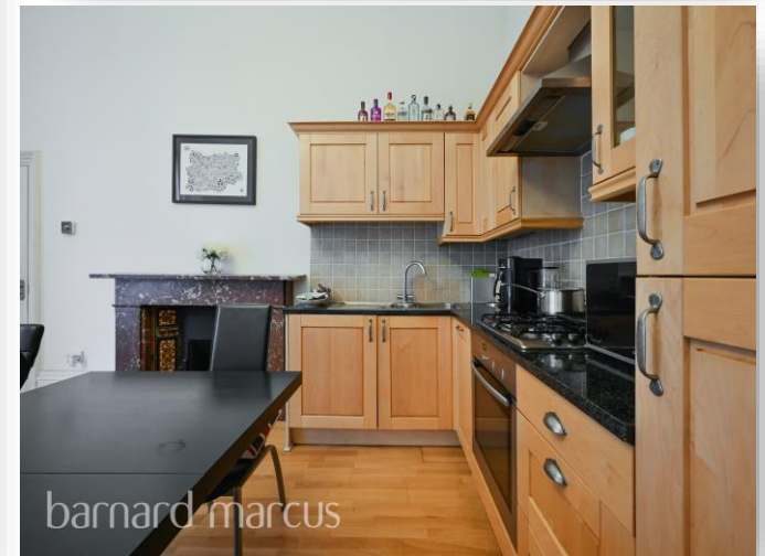
Forest Lodge West Hill, London SW15 3SP