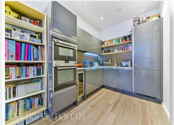
Beacon Tower, Spectrum Way, London, SW18 4GL