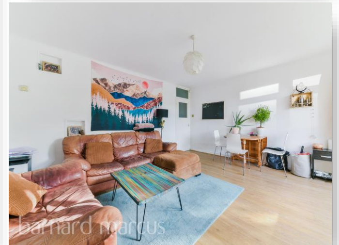
Arnal Crescent, London, SW18 5PX