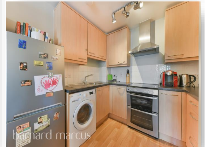
Hannay House, Scott Avenue, London, SW15 3PD