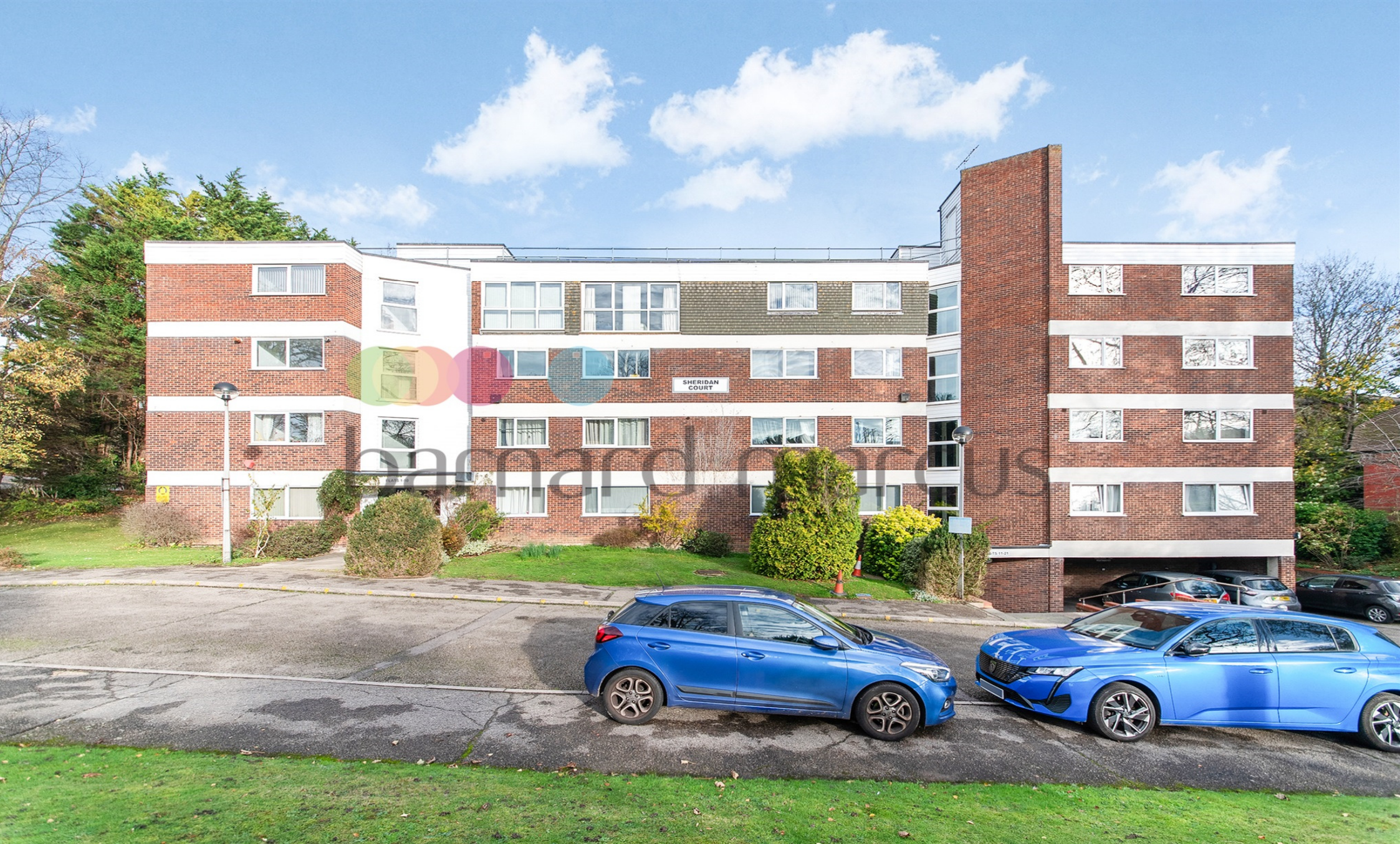
Sheridan Court Coombe Road, Croydon CR0 5SP