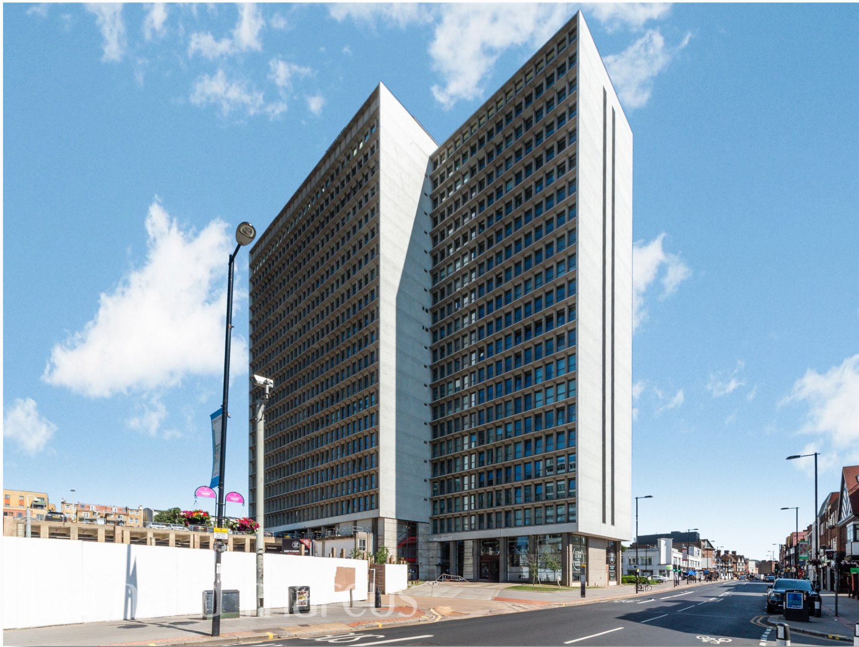
Leon House High Street, Croydon CR0 1FY