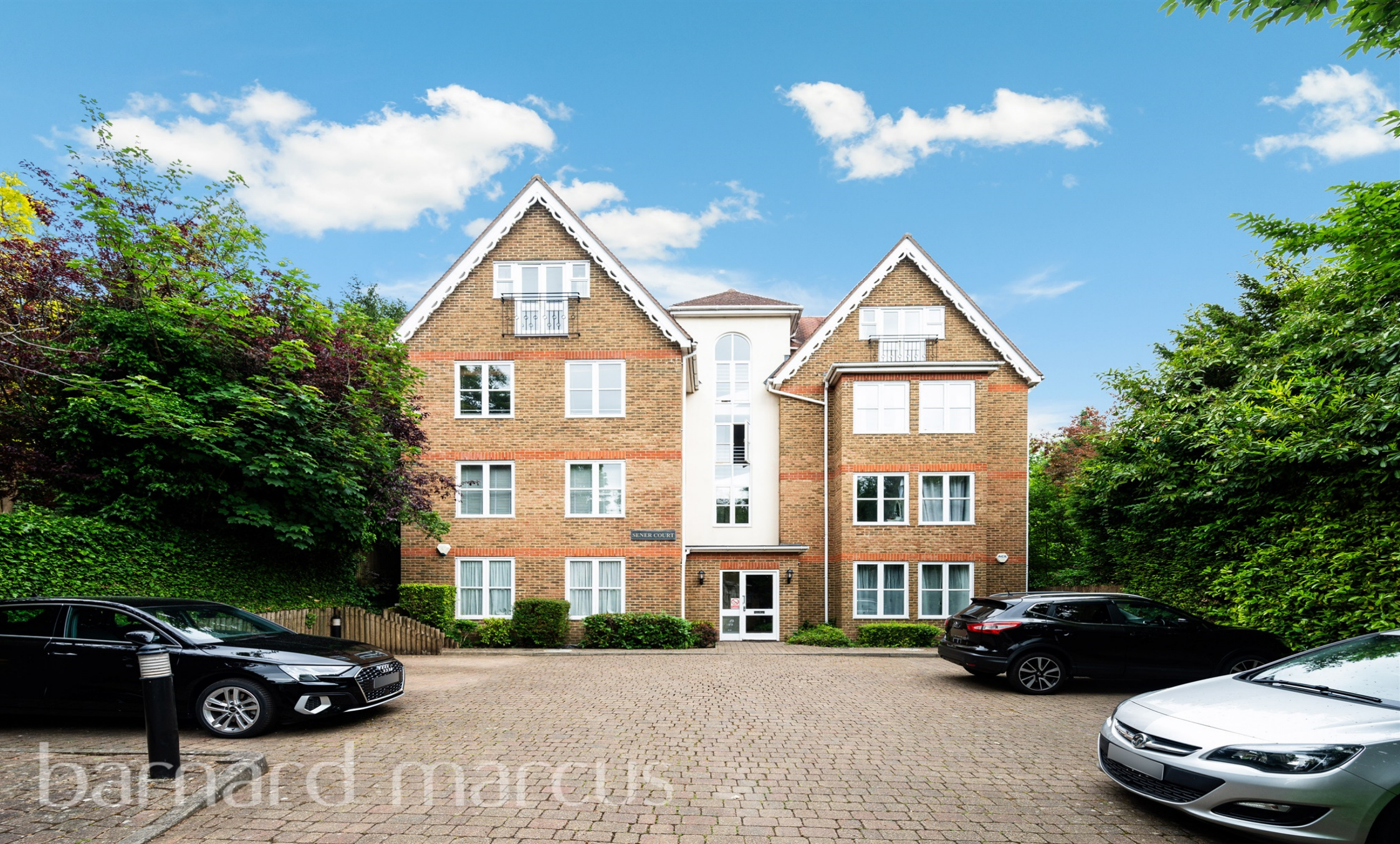
Sener Court Haling Park Road, South Croydon CR2 6NL