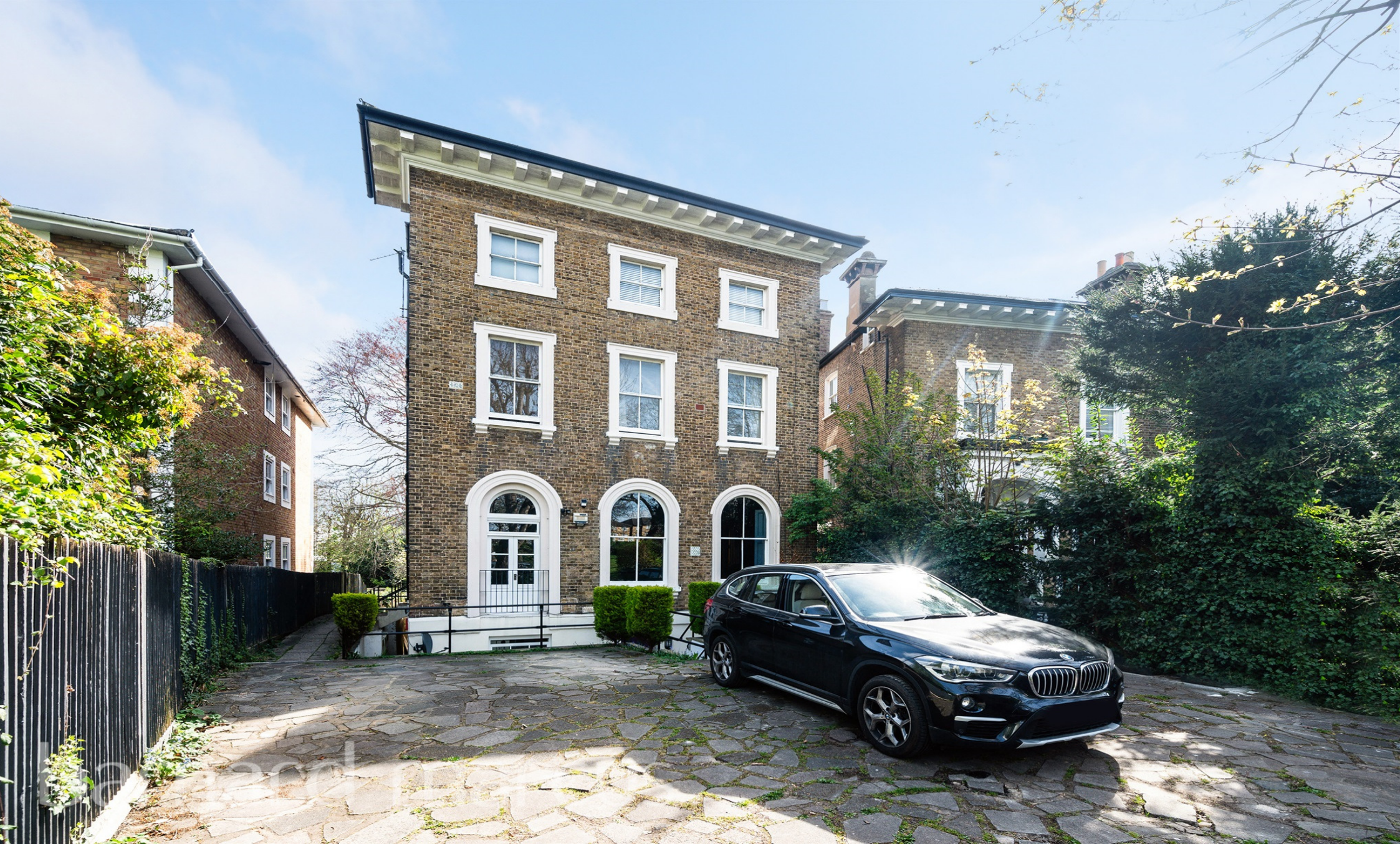
The Waldrons, Croydon CR0 4HB