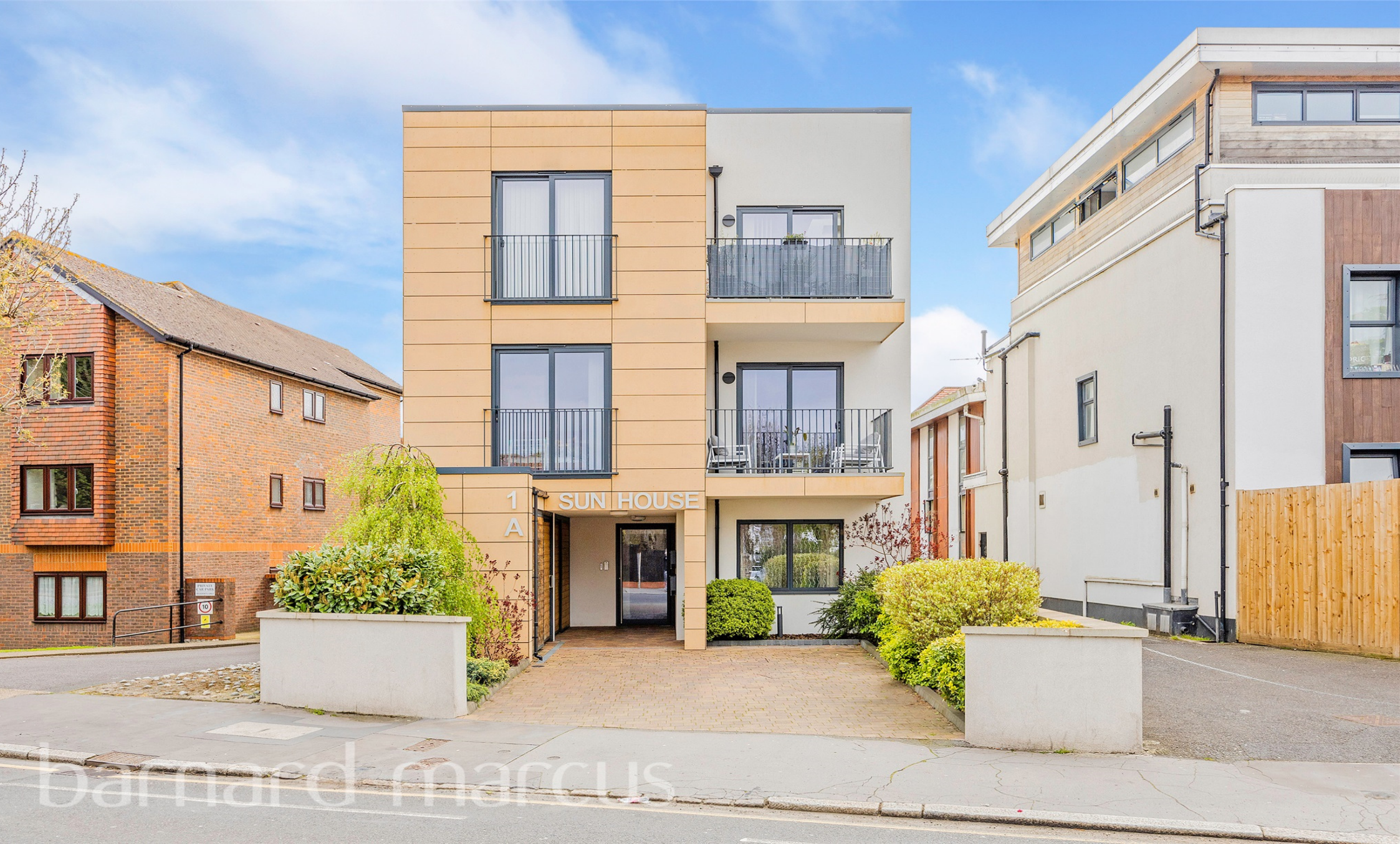
Sun House South Park Hill Road, South Croydon CR2 7DY