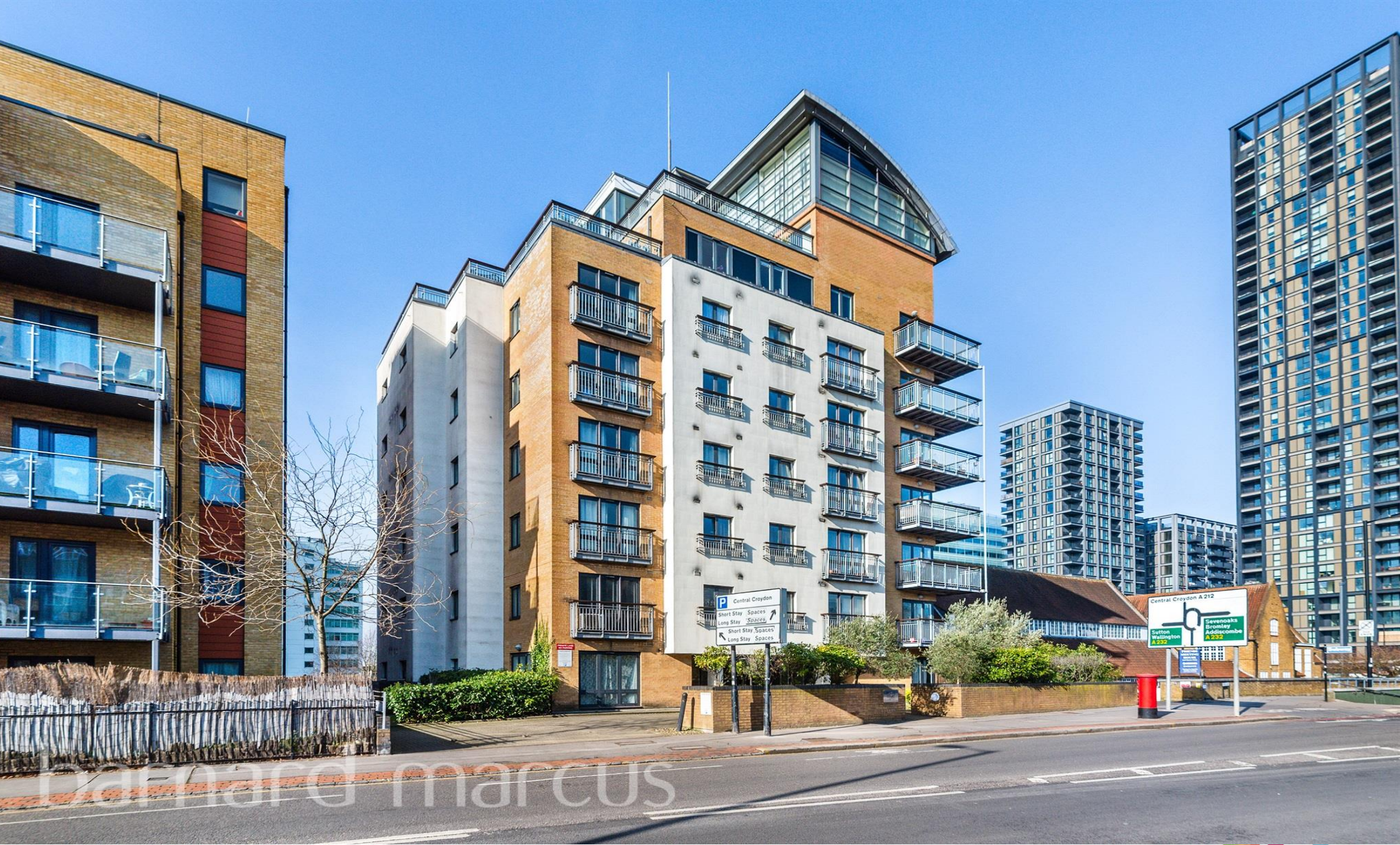
Skyline Court Park Lane, Croydon CR0 1JH