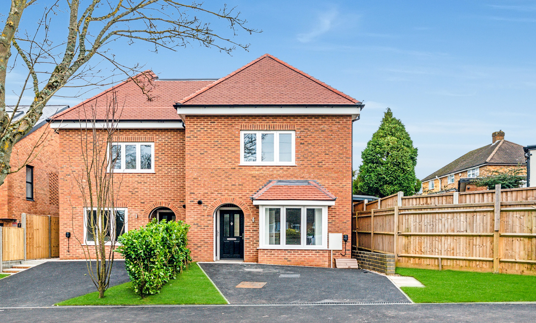
Belvedere House Croham Valley Road, South Croydon CR2 7JH