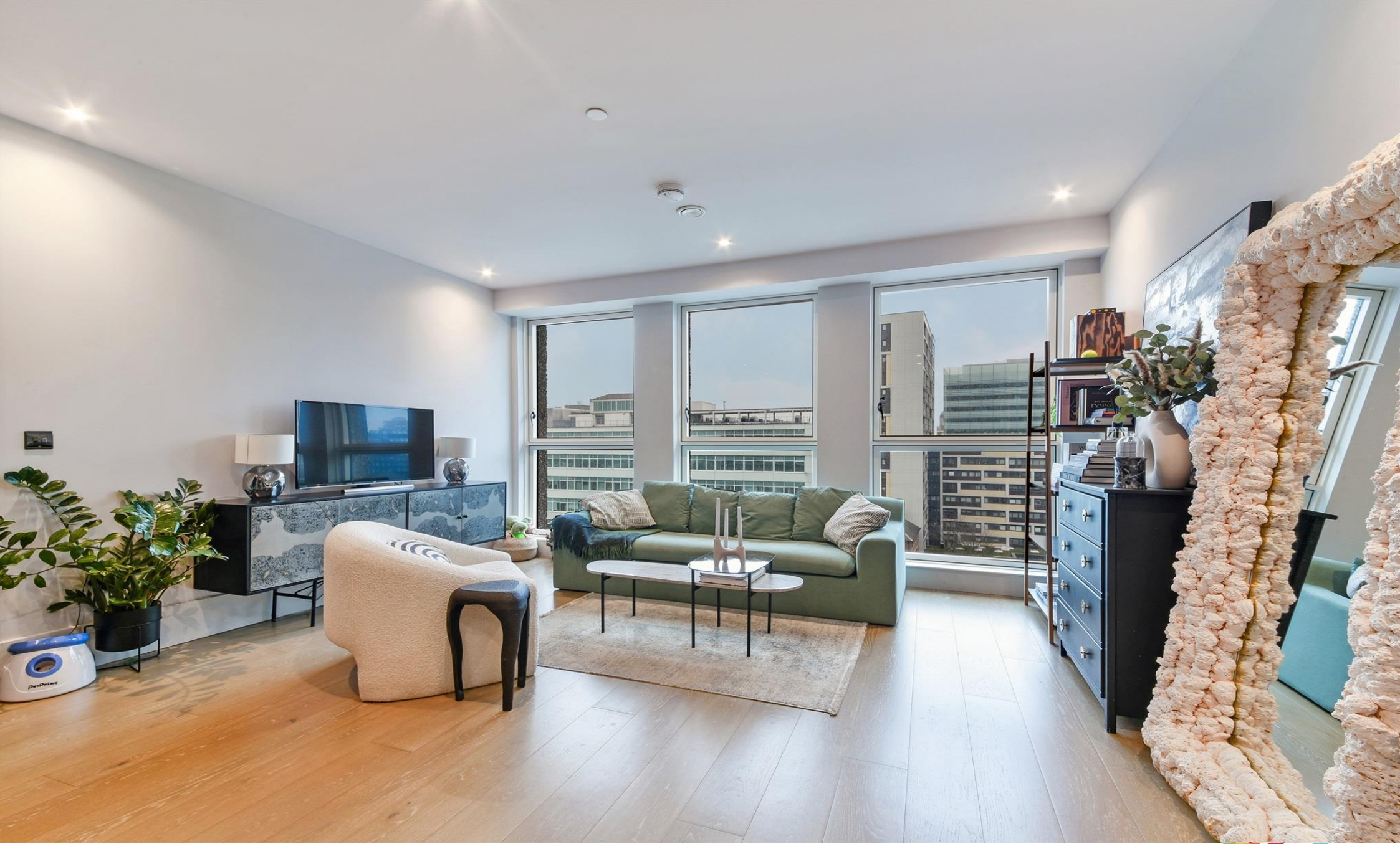
Leon House, High Street, Croydon CR0 1FX