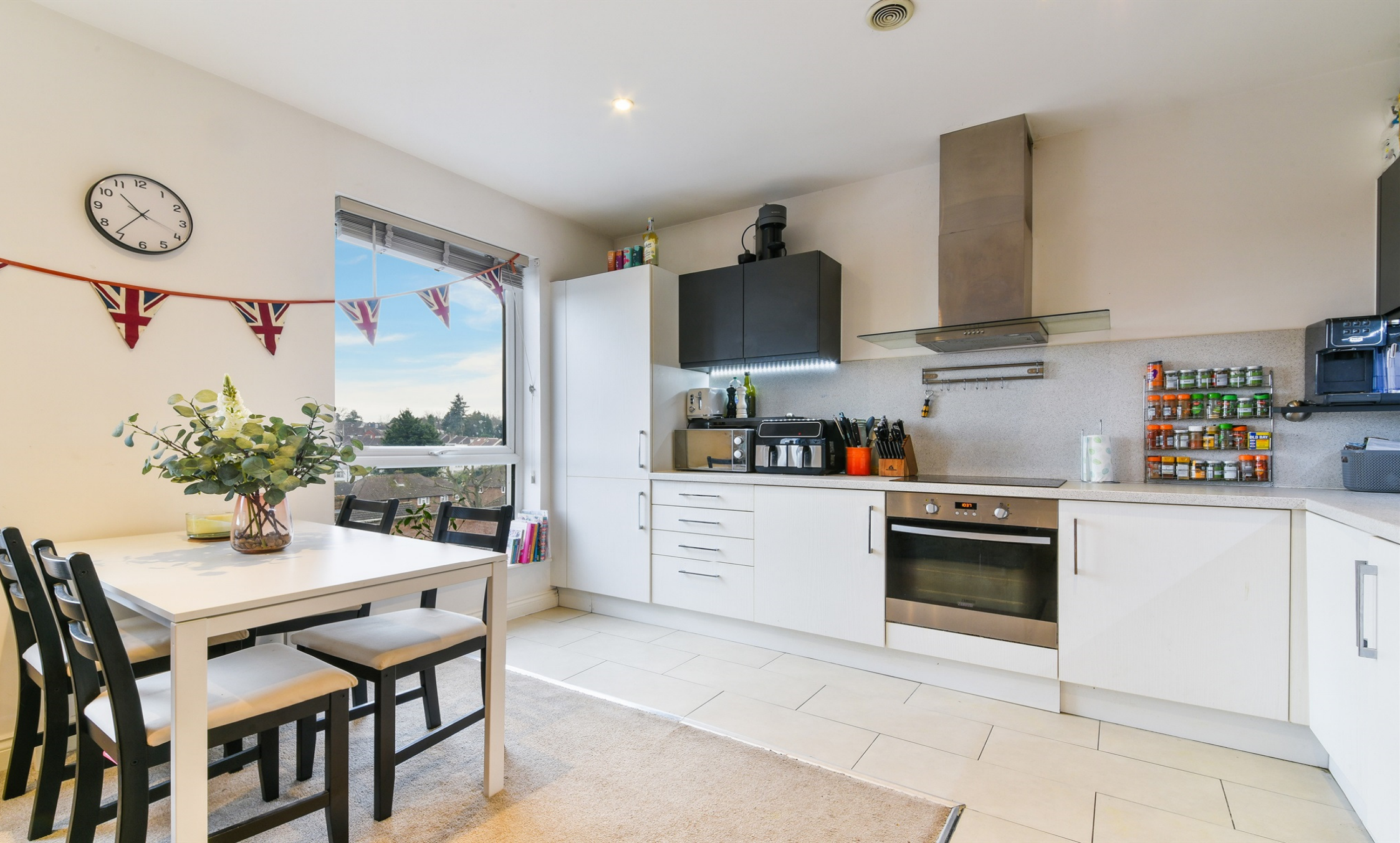
Faversham House Addington Road, South Croydon CR2 8LE