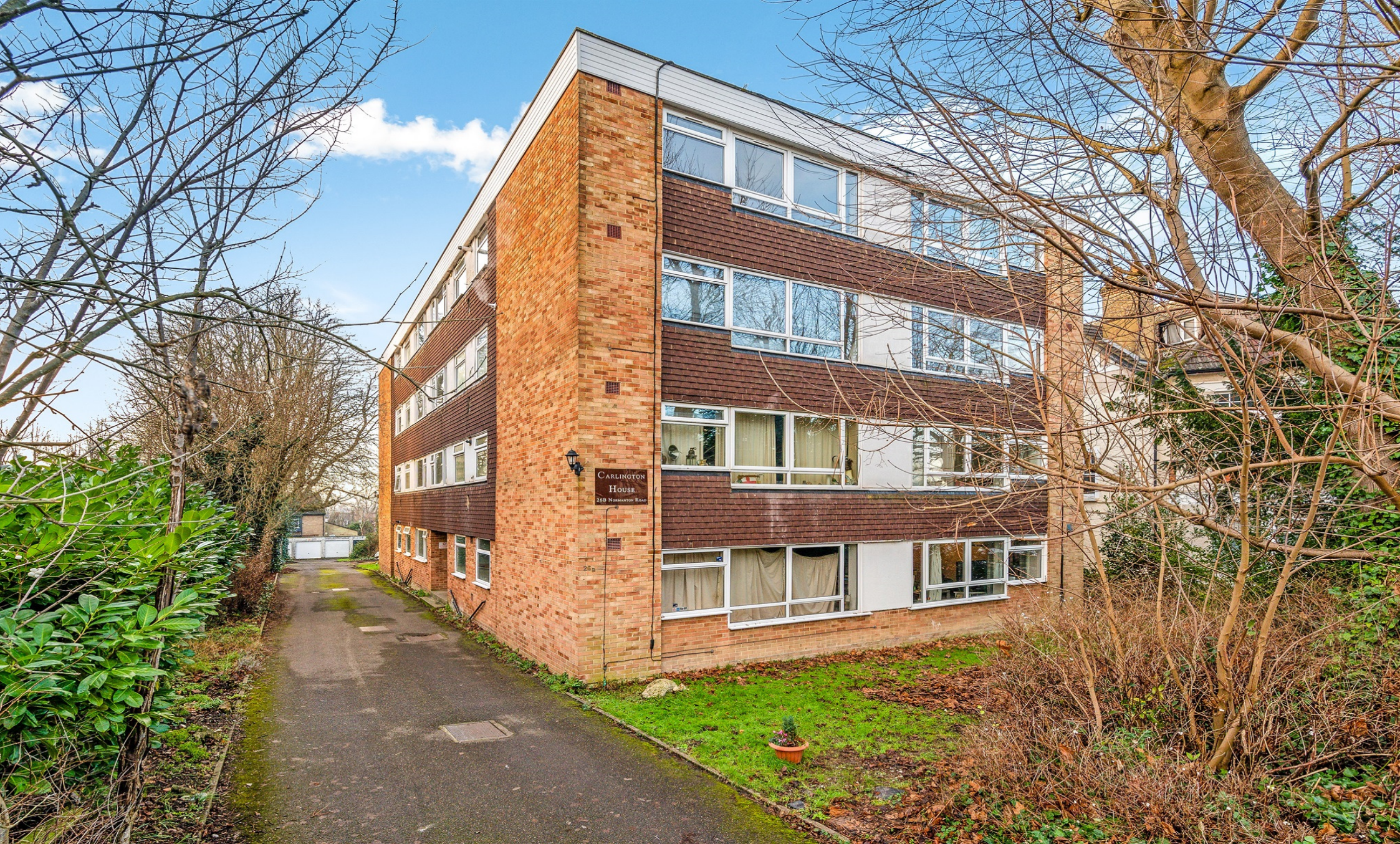
Carlington House Normanton Road, South Croydon CR2 7AR