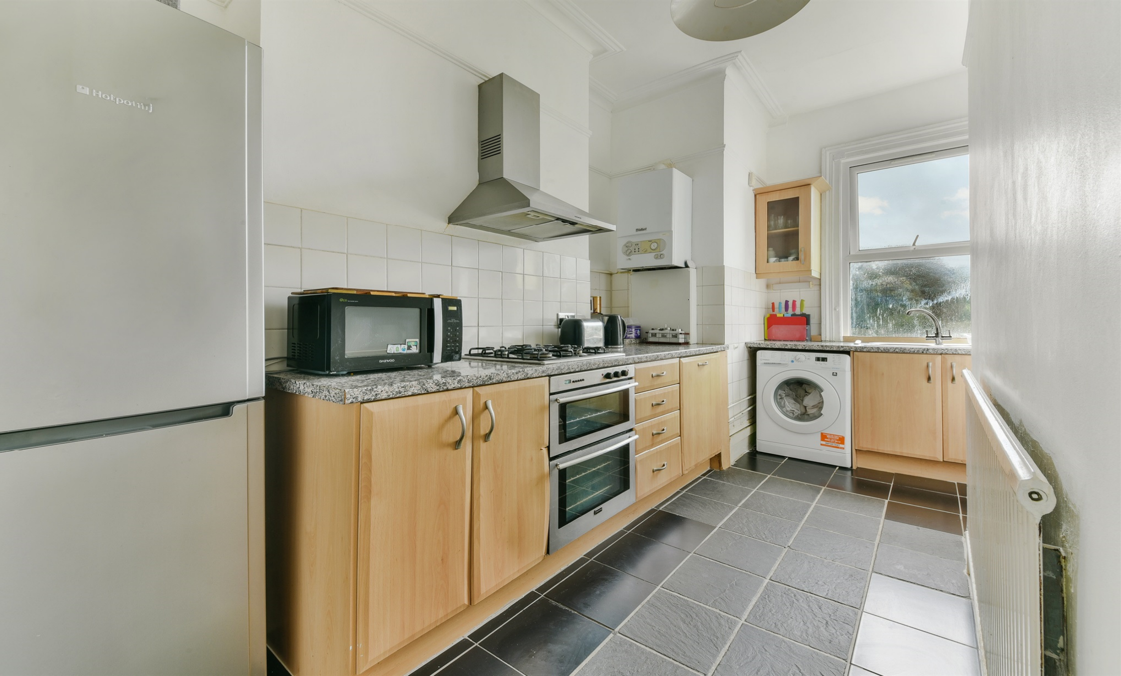
Birdhurst Rise, South Croydon CR2 7EJ