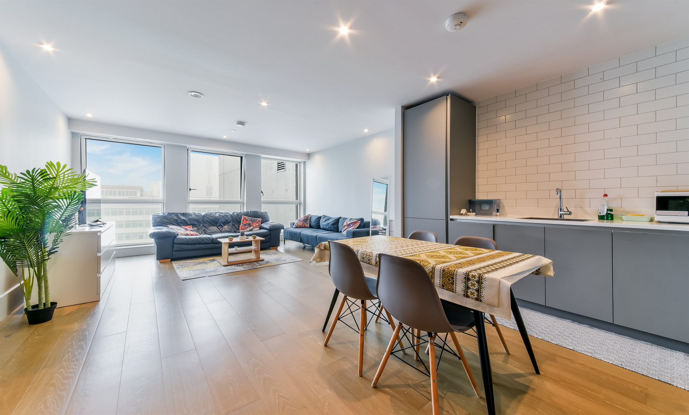
Leon House High Street, Croydon CR0 1FX