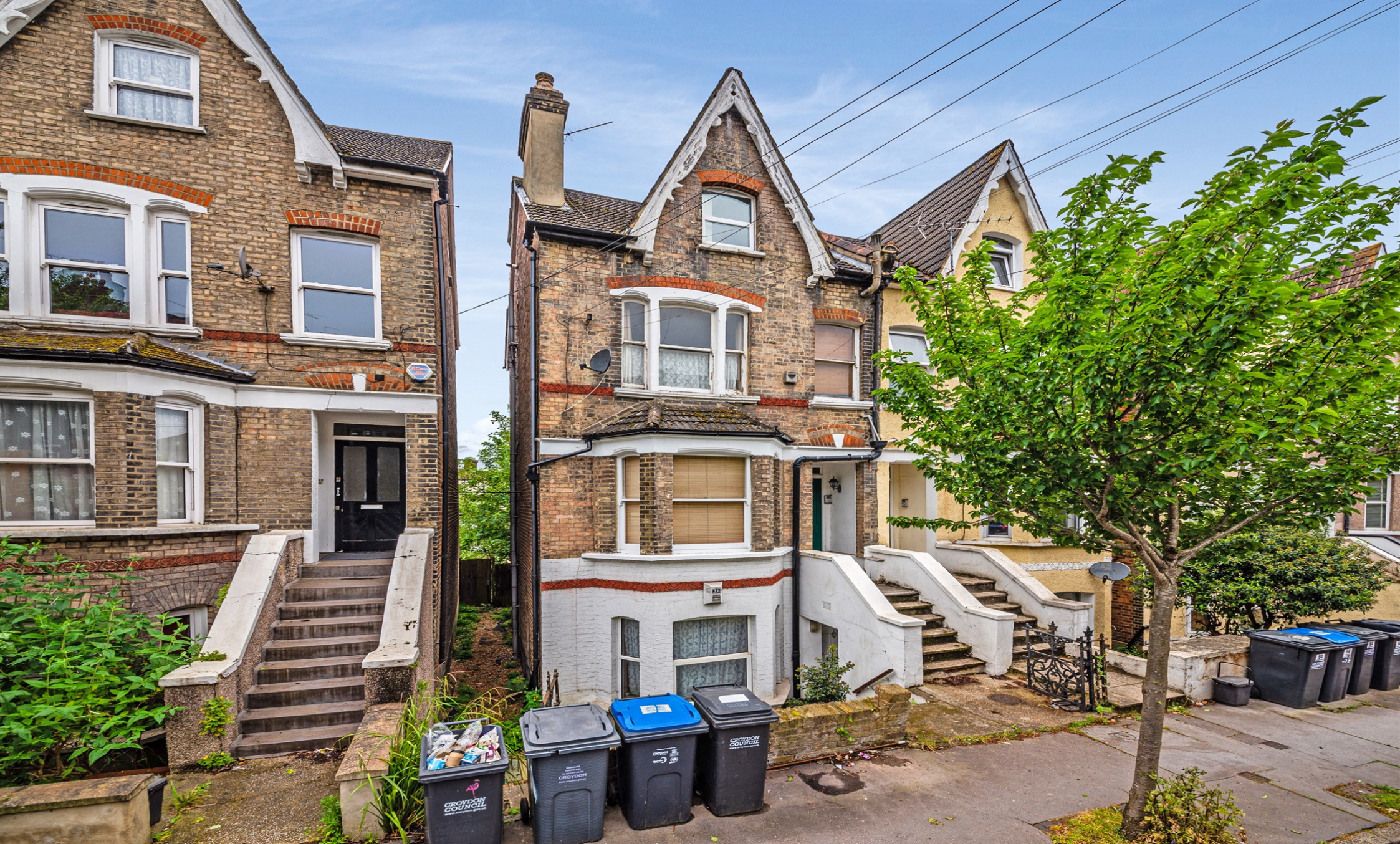
The Garden Flat At Heathfield Road, Croydon CR0 1EW