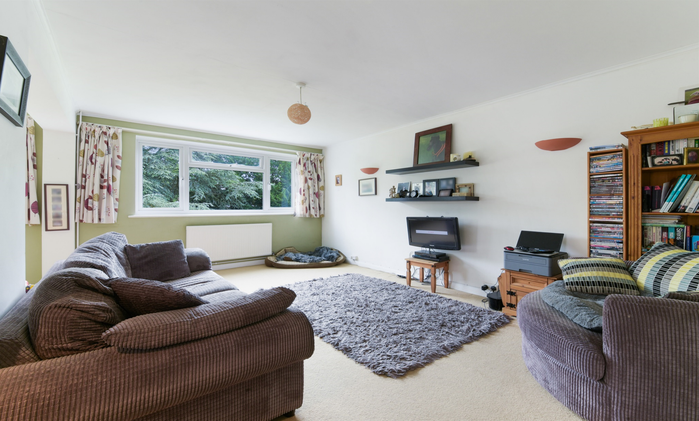
Sylvan Court Haling Park Road, South Croydon CR2 6NJ