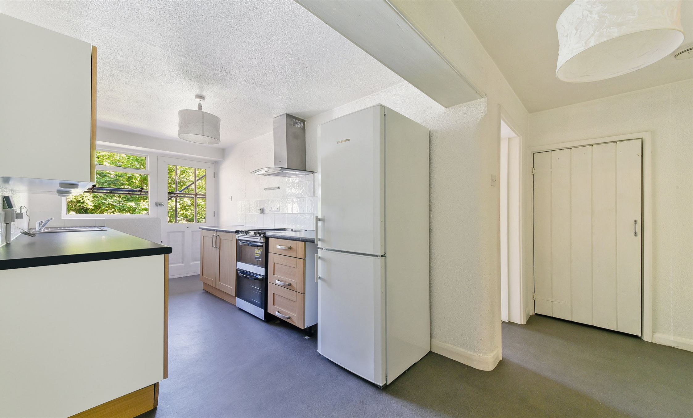
Basement Flat Avondale Road, South Croydon CR2 6JE