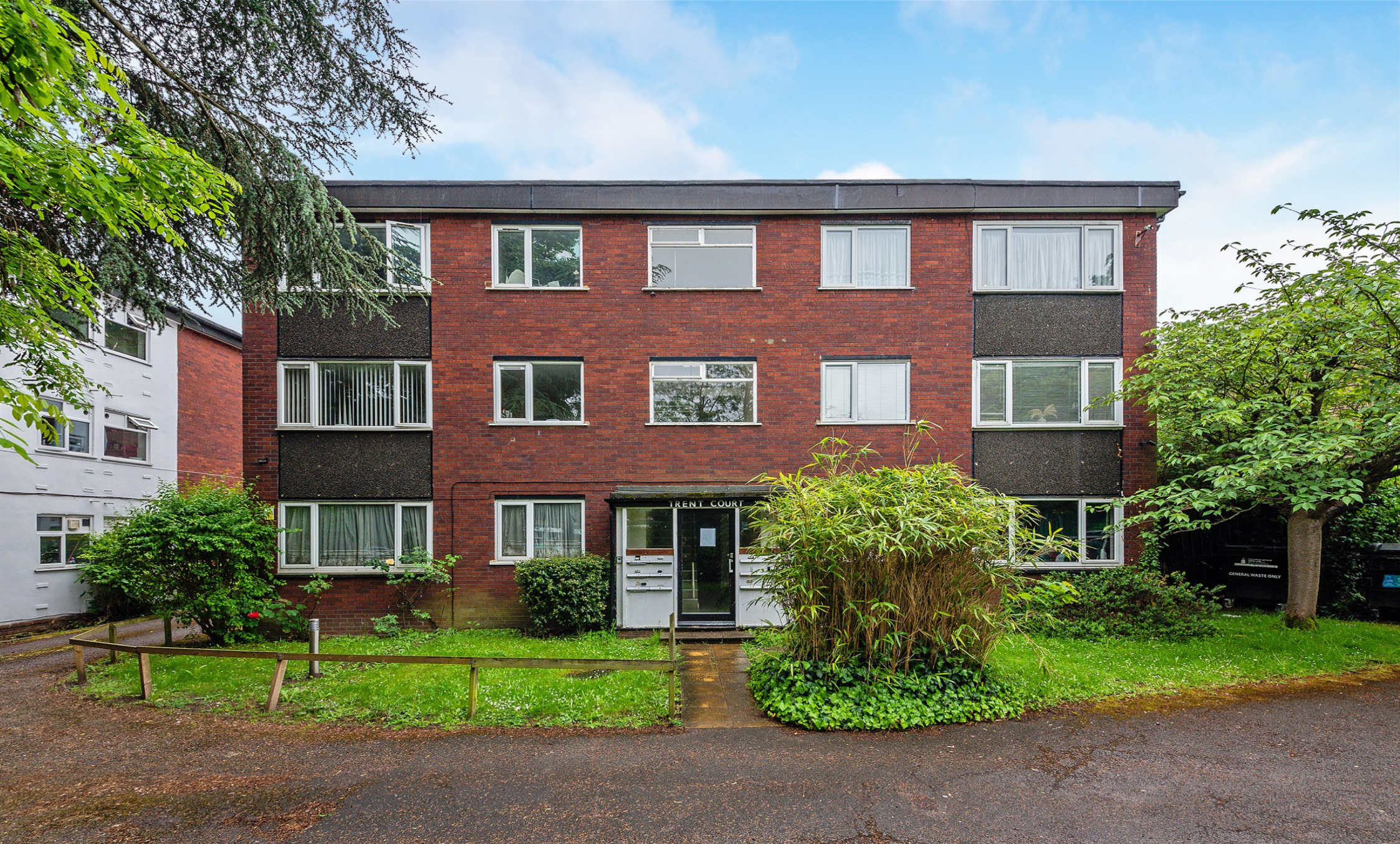
Trent Court Nottingham Road, South Croydon CR2 6LN