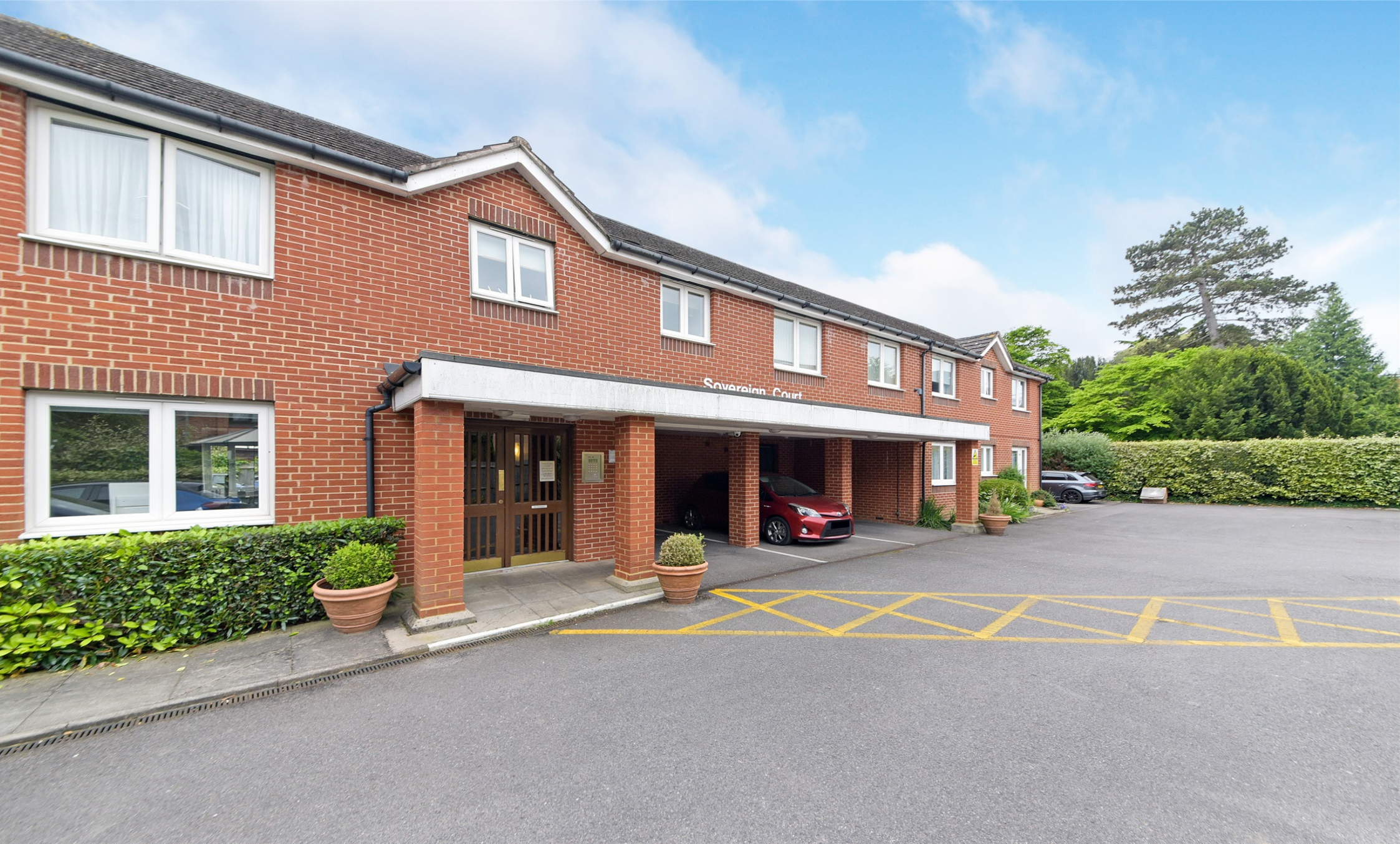
Sovereign Court Warham Road, South Croydon CR2 6LP