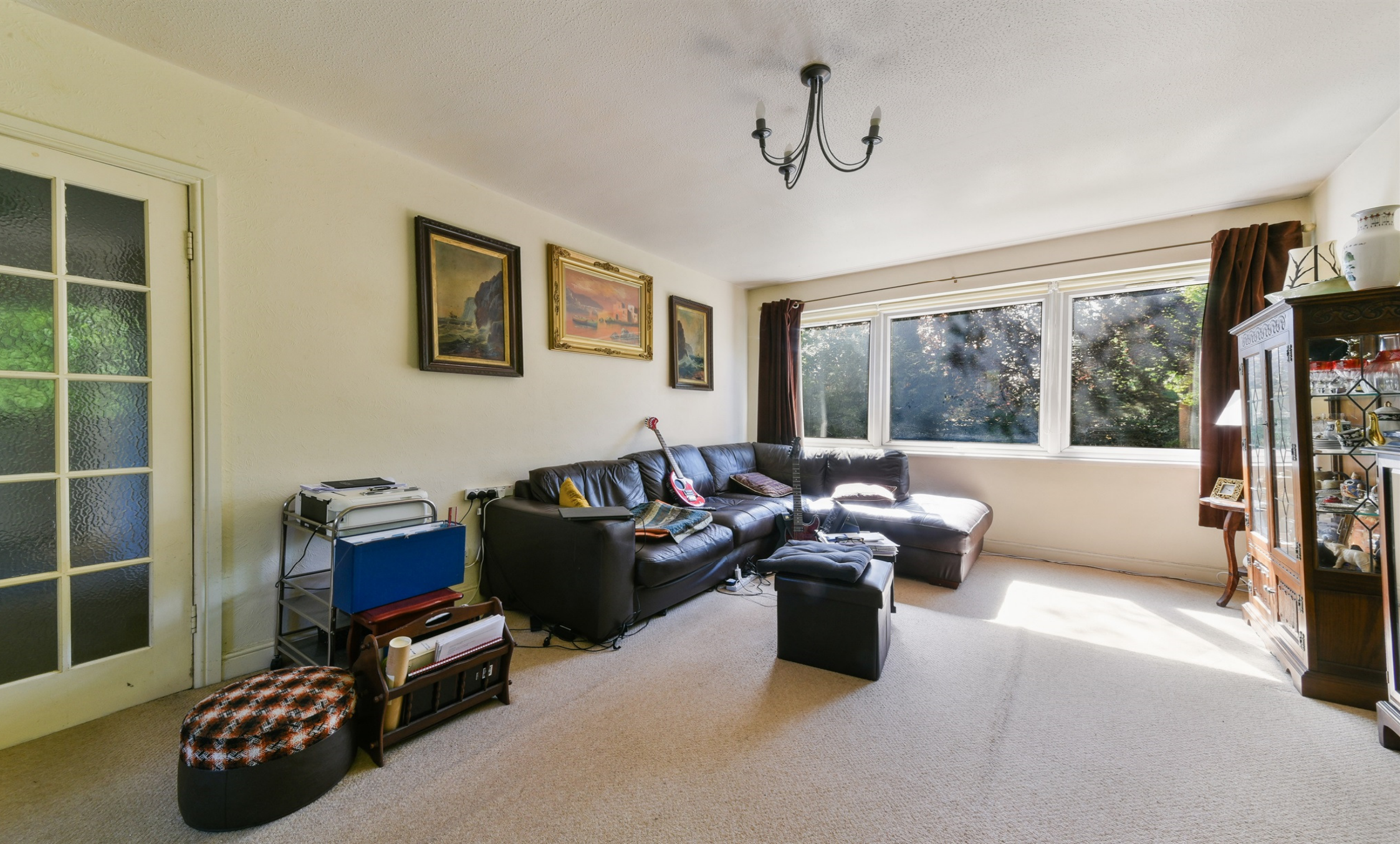
Beechfield Court Bramley Hill, South Croydon CR2 6LT