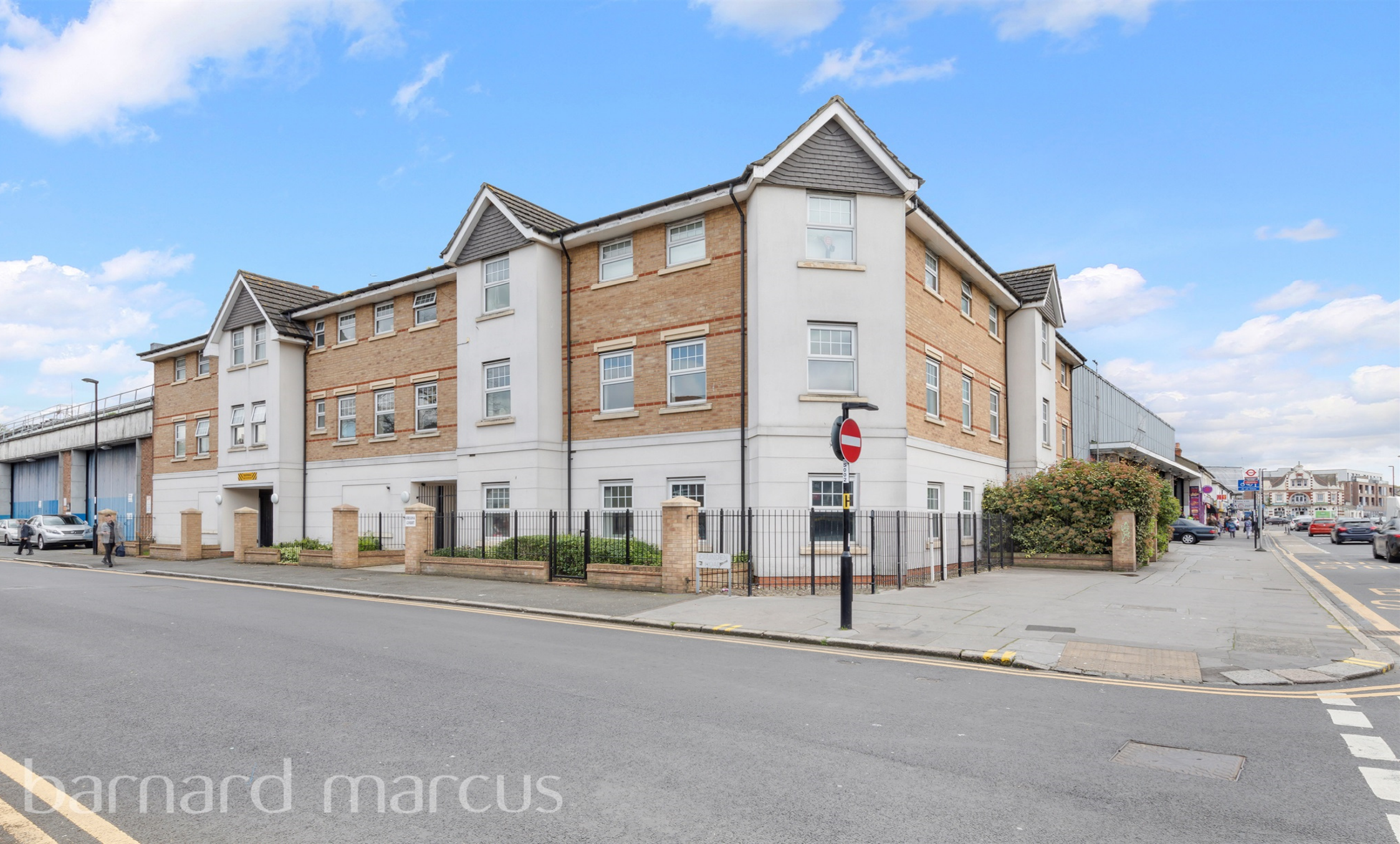
Oriana Court Crunden Road, South Croydon CR2 6GZ