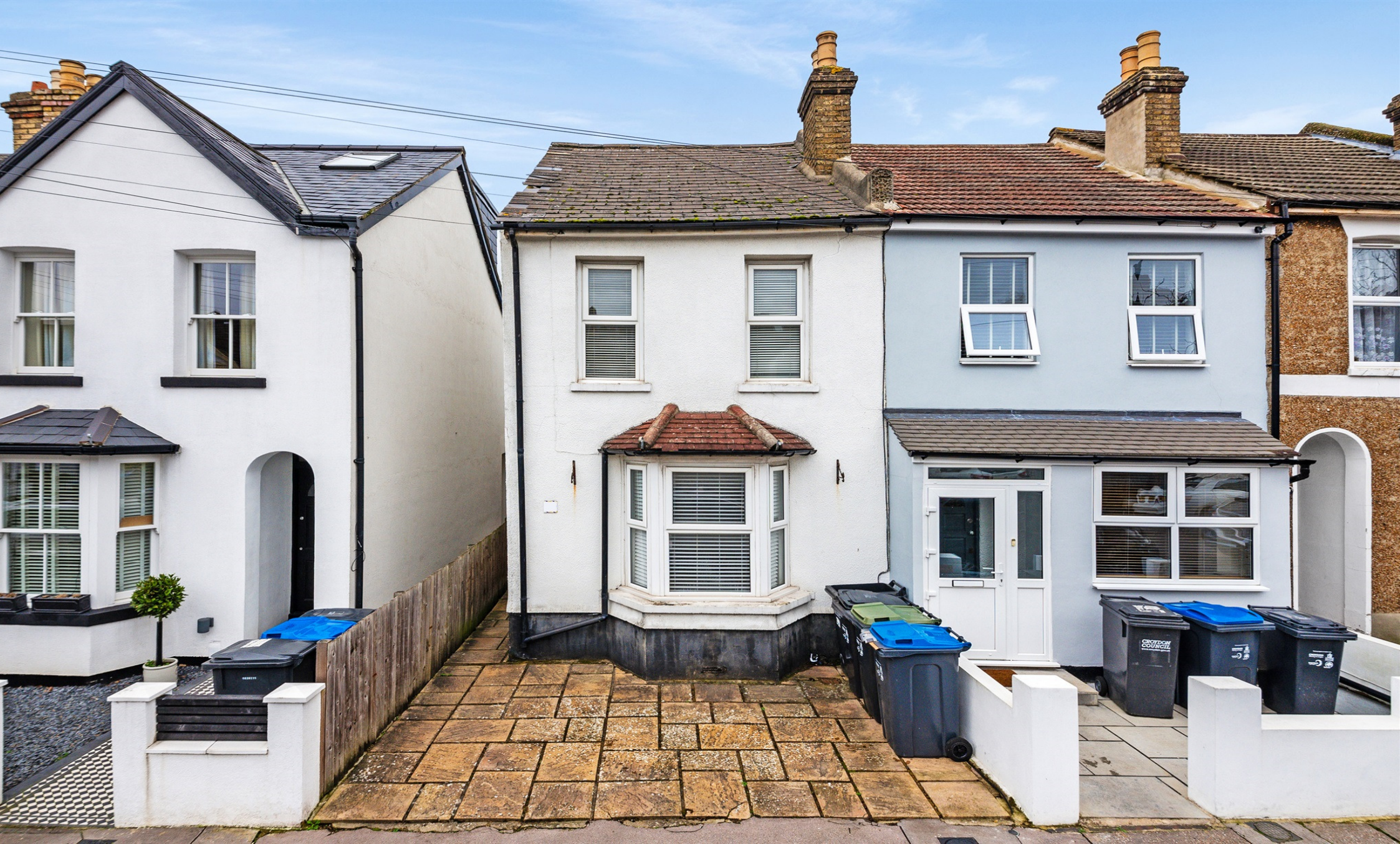
Mansfield Road, South Croydon CR2 6HP