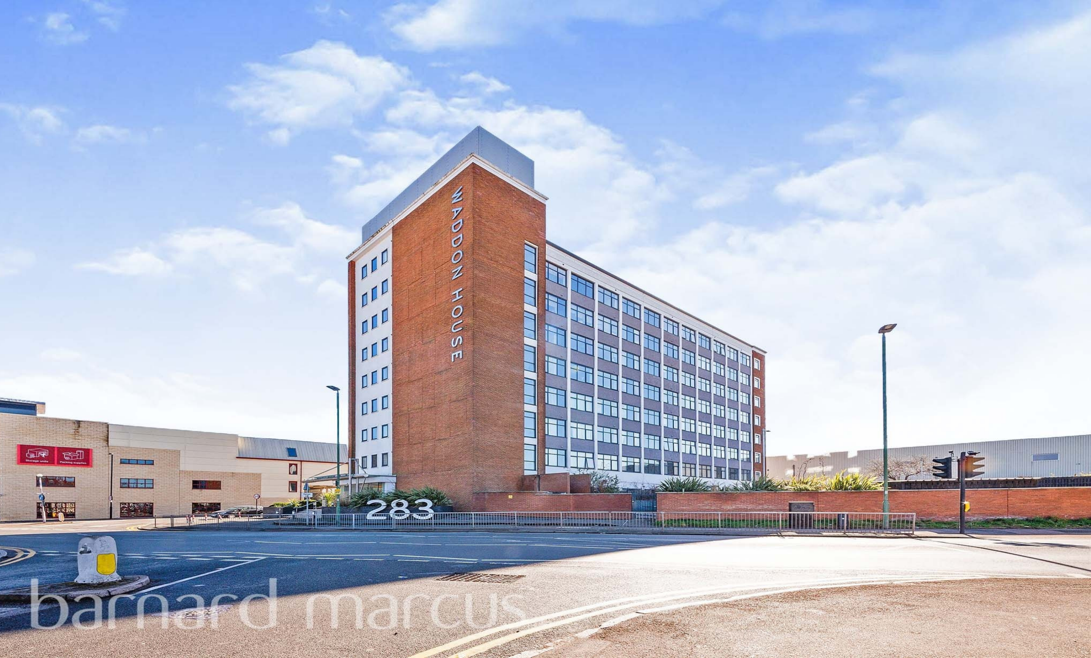
Waddon House Stafford Road, Croydon CR0 4FA