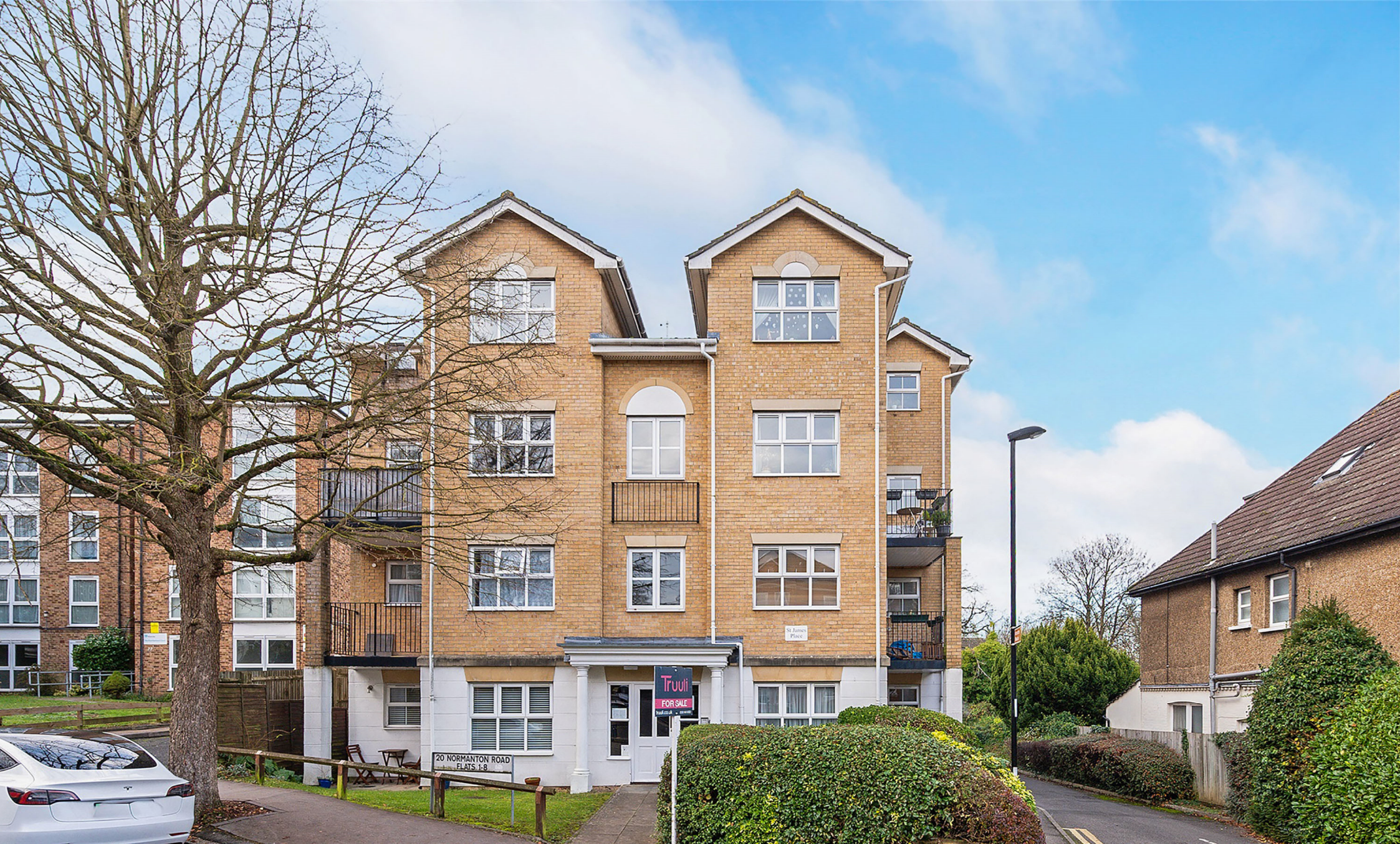
St. James Place Normanton Road, South Croydon CR2 7AR