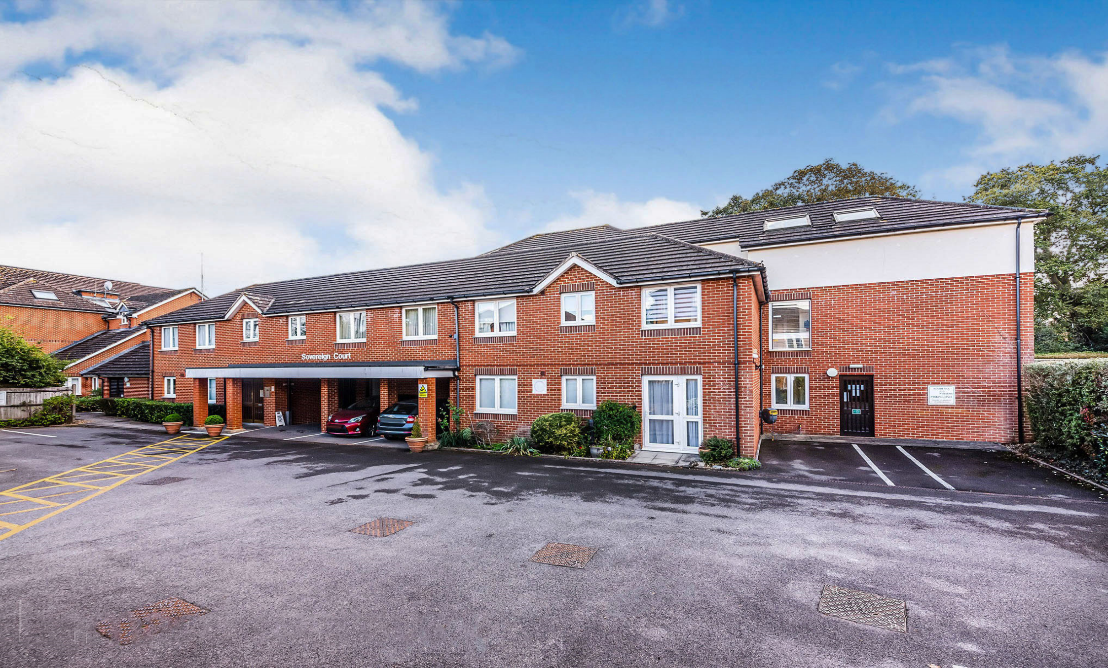
Sovereign Court Warham Road, South Croydon CR2 6LP