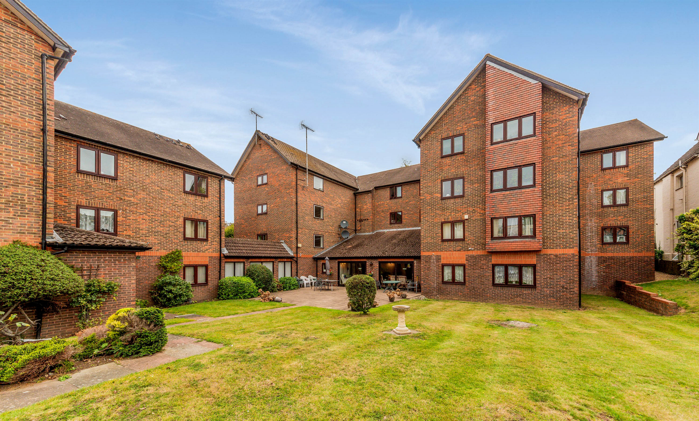
Autumn Lodge South Park Hill Road, South Croydon CR2 7DY