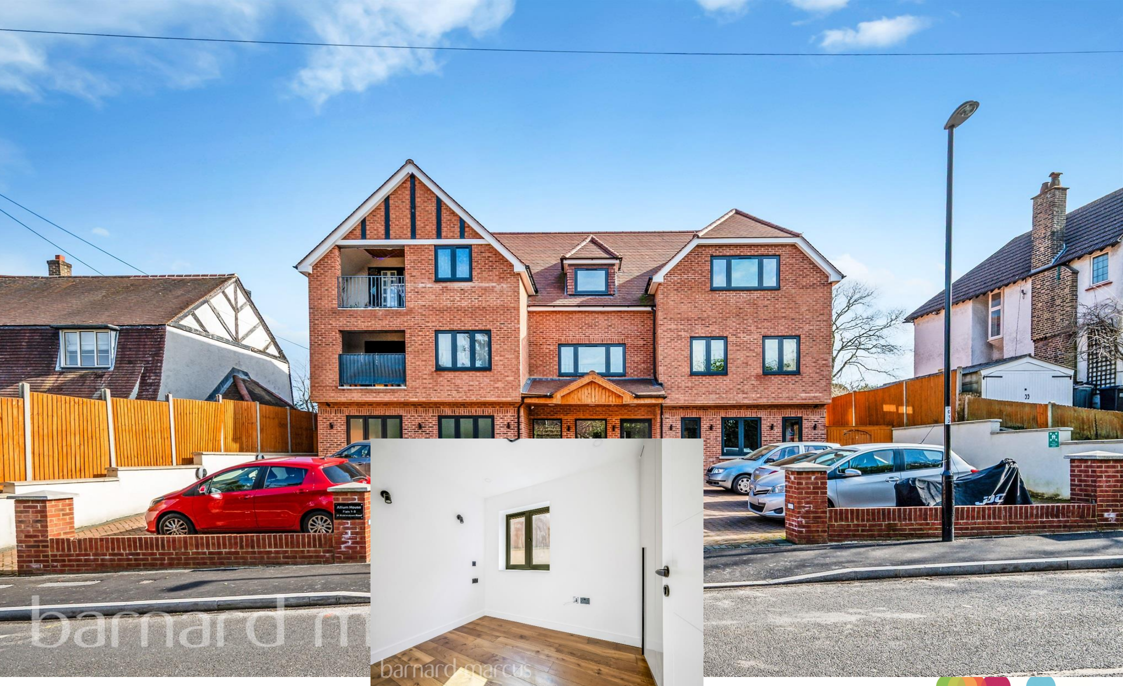
Allium House Riddlesdown Road, Purley CR8 1DJ