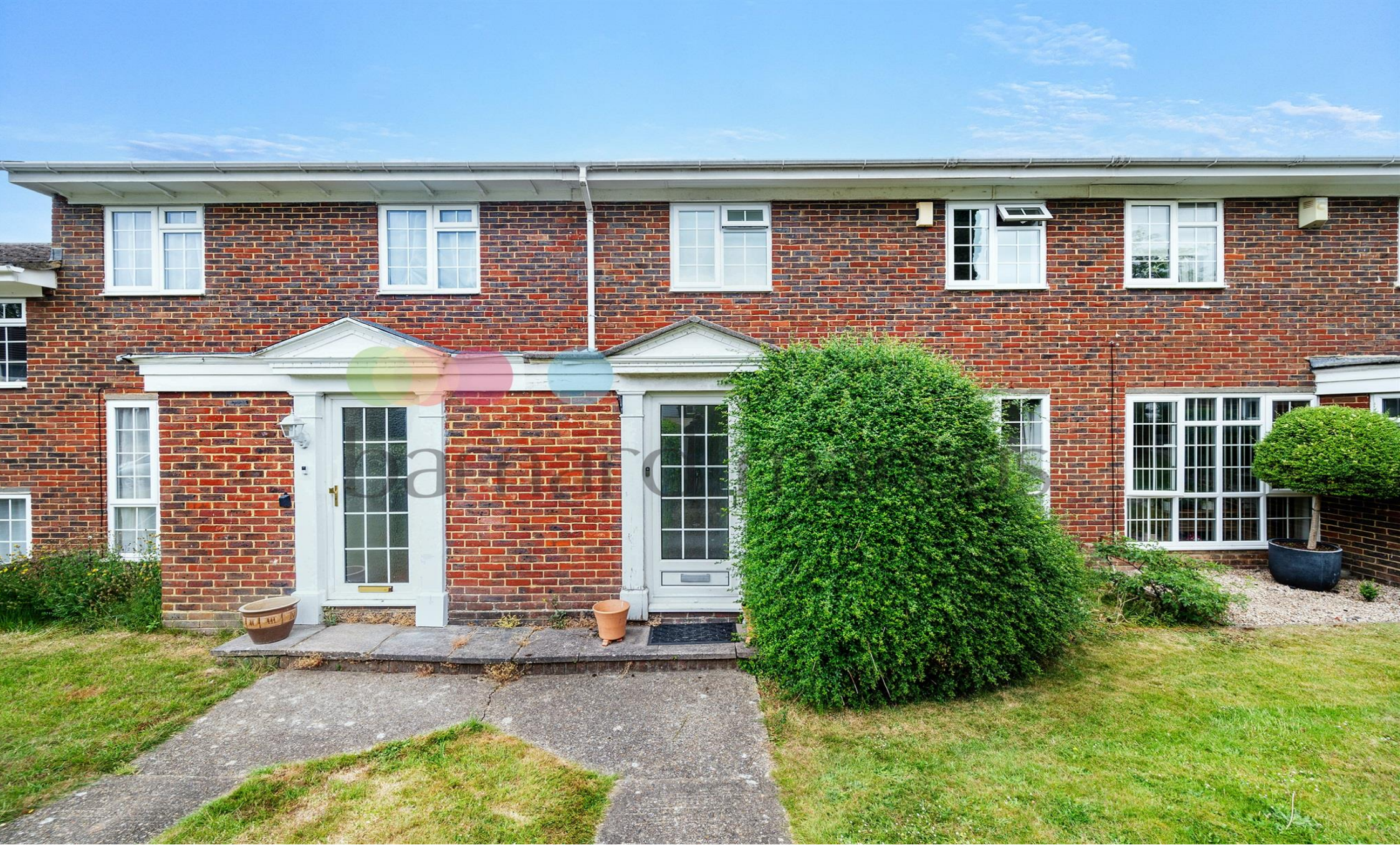
Ridge Langley, South Croydon CR2 0AQ