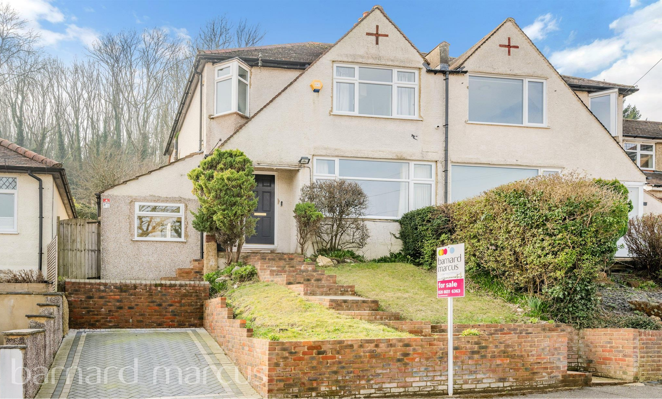
Valley Road, Kenley CR8 5BY